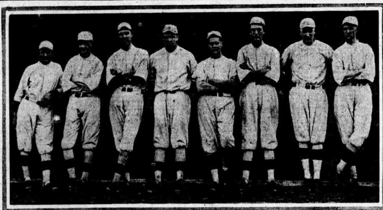
RED SOX PITCHERS.