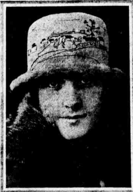
Fascinating sport hats are seen this fall in lovely lawn and tan shades, enhanced by a very new form of trimming.