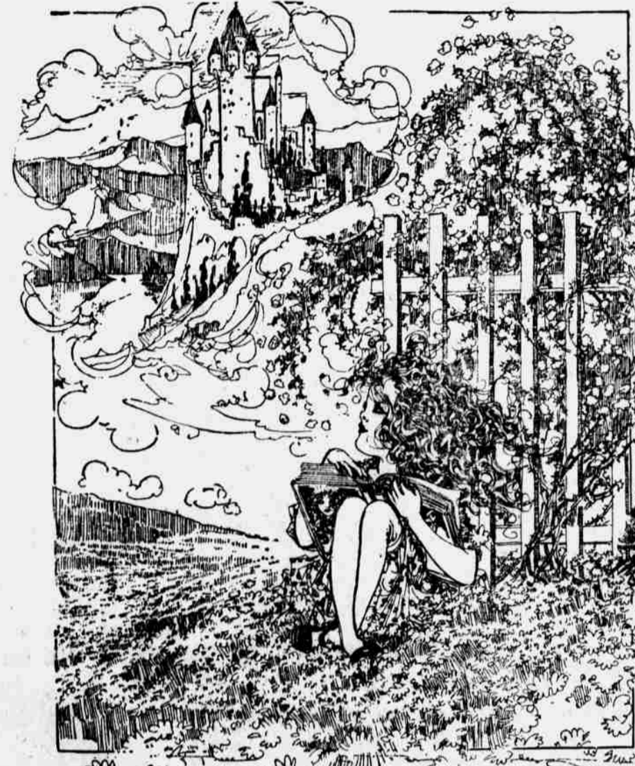
See our castle when we're little, but—