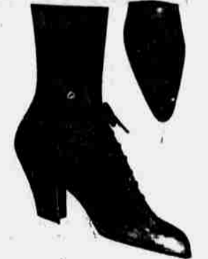
Drexel's Arch Preserver