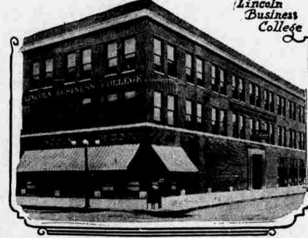
Lincoln Business College