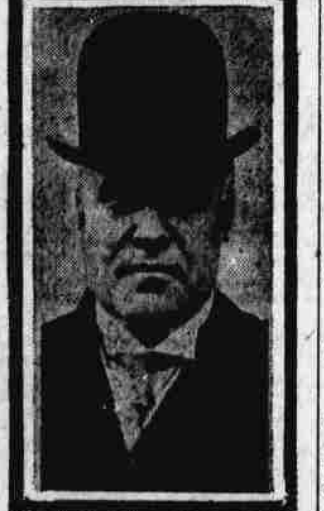
LOUIS D. BRANDEIS BELOW-FRANKLIN K. LANE