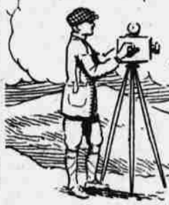
PHOTO PLAYS FOR OMAHA DEVOTEES