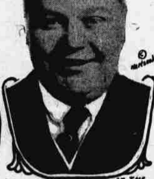
Roscoe Arbuckle at the Strand