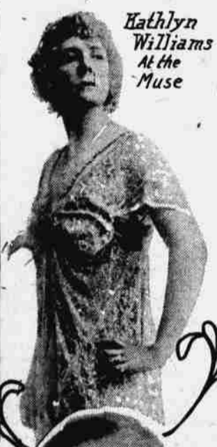
Kathlyn Williams at the Muse