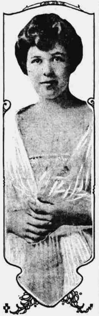
MISS LUCILE BACON.

church choir sang the Lohengrin wedding march.