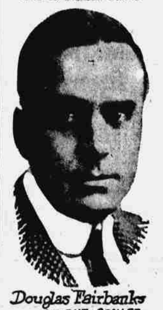
Douglas Fairbanks AT THE ROHLFF

HOUSE PETERS ON BILL AT THE NEW STAR TODAY House Peters and Beatriz Michelena, the author of The Bee's "Talks to Screen-Struck Girls," will be at the New Star theater today in "Mignon," a five-reel drama of exceptional value. These popular players have appeared for New Star patrons in "Salvation Nell," "Hand of Peril," and "The Closed Road."