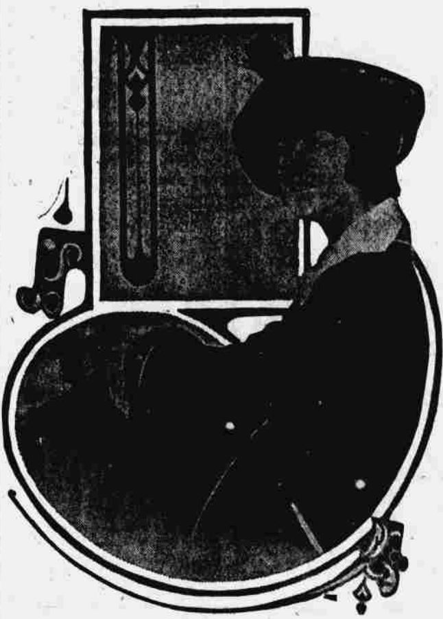
ANN PENNINGTON, FAMOUS-PLAYERS-PARAMOUNT STAR.

Ann Pennington, who, despite her diminutive size, has been one of the hits in musical productions in the last three years, has deserted the stage and signed a long-term contract with the Famous Players to star in productions for the Paramount program. Miss Pennington is one of the most popular personalities in the theatrical world despite her small stature and extreme youth; she bubbles over with fun and enthusiasm, and is a natural comedienne. She will undoubtedly repeat in the silent drama successes which she scored on the stage.