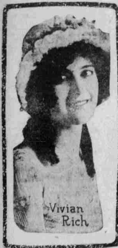
GAYETY OPENS WITH ITS NEW SUMMER POLICY