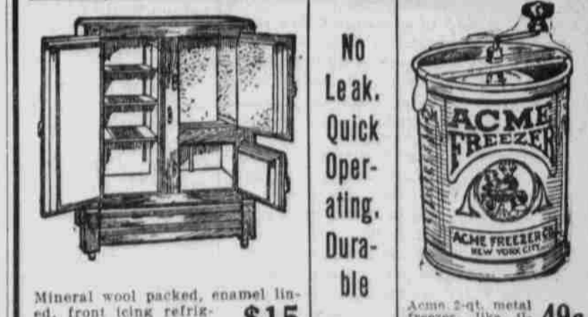
Mineral wool packed, enamel lined, front icing refrigerator, like illustration, $15 Acme 2-qt. metal freezer, like illustration, 49c

A Safe Place to Trade. Our Guarantee Protects You.