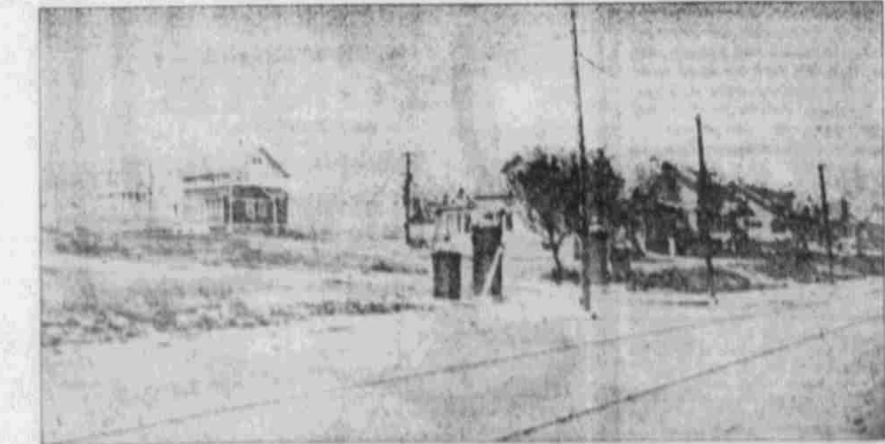
Leavenworth Heights, May 1916

These prices include water, sewer, gas and sidewalks, all in and paid for. Building restrictions such as to make it an ideal place for homes. Omaha is starting on an era of unprecedented growth. Now is the time to invest. You will never be able to buy as cheaply again. If you want a lot for use or for investment. If you want to begin putting away something each month and soon own a part of the earth, don't fail to see these lots. We will be glad to put our time against yours and show them to you. Take Leavenworth street car and get off at 45th street and you are there, or call our office and go in automobile any time before hour of sale.