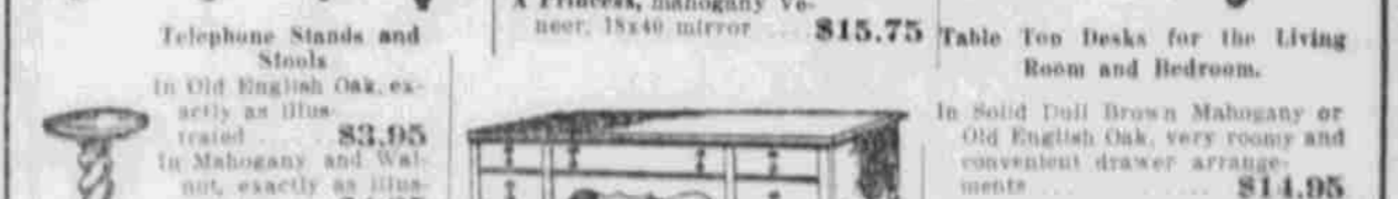
Telephone Stands and Pedestals. In Old English Oak, exactly as illustrated $3.95. In Mahogany and Walnut, exactly as illustrated $4.25. Pedestals in oak and mahogany finish, 3-inch column square and round $1.75. In solid mahogany, beautiful vase shape column $5.25. Walnut, like illustration $2.75.

4 Values in Odd Dressers—If they meet your requirements they are too good to let go by— A Good Oak Dresser, roomy, well finished, 24 x32 mirror $ 8.75 Another, slightly larger, $ 9.75 A Princess, in Fumed Oak, 18x40 mirror $14.50 A Princess, mahogany veneer, 18x40 mirror $15.75