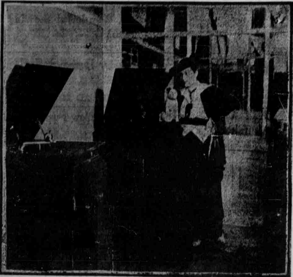
HIGHLY PLEASED WITH MICKEL'S VICTROLAS