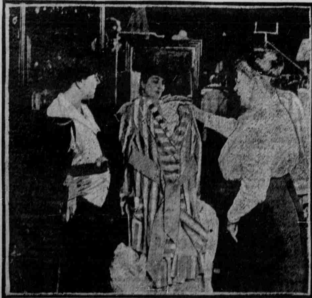
BOOSTS BEDDEO'S CREDIT SYSTEM.

The Celebrated Actress, Keenly Enjoys a Trip to Various Omaha