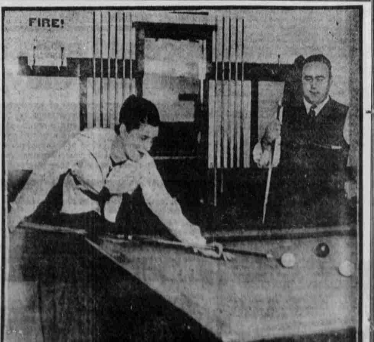
PLAYED "ERNIE" HOLMES A GAME OF BILLIARDS.