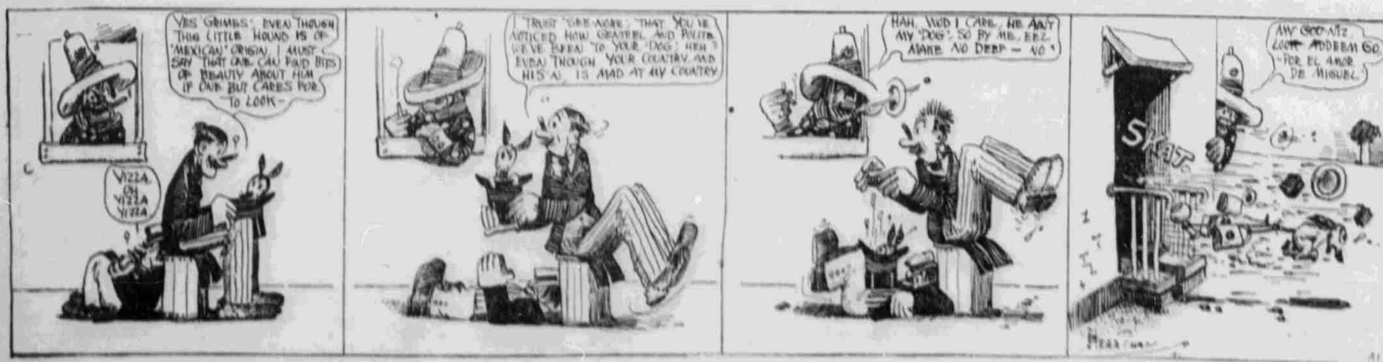
Drawn for The Bee by Herriman