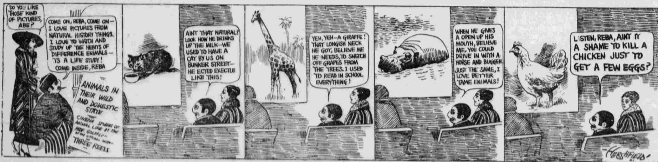
Baron Bean--Out Goes the Dog