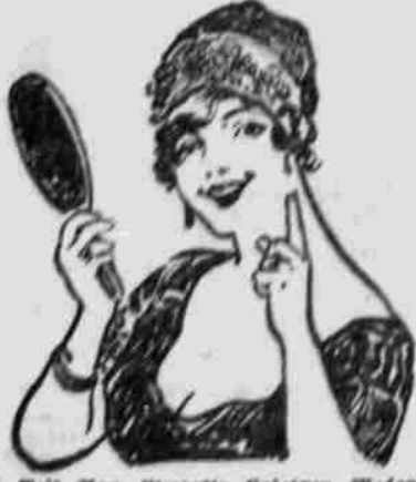
"I Tell You Stuart's Calcium Wafers Are Wonderful Beauty Makers!"

The difference in the appearance of the skin, after a few days' use of Stuart's Calcium Wafers, is startling. They are without doubt the greatest skin beautifiers in existence, and the most effective radiators of blood impurities known to science.