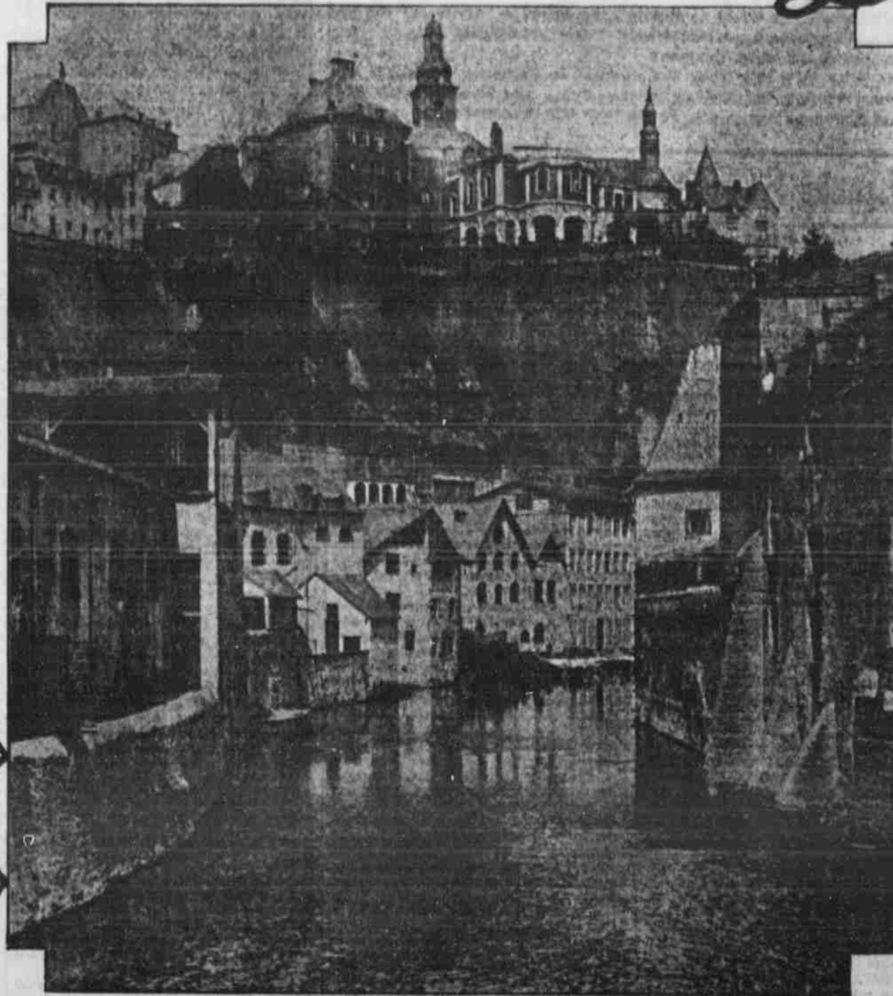
The Picturesque City of Luxemburg, with the Palace Where the Grand Duchess Is Held Virtually a Prisoner.