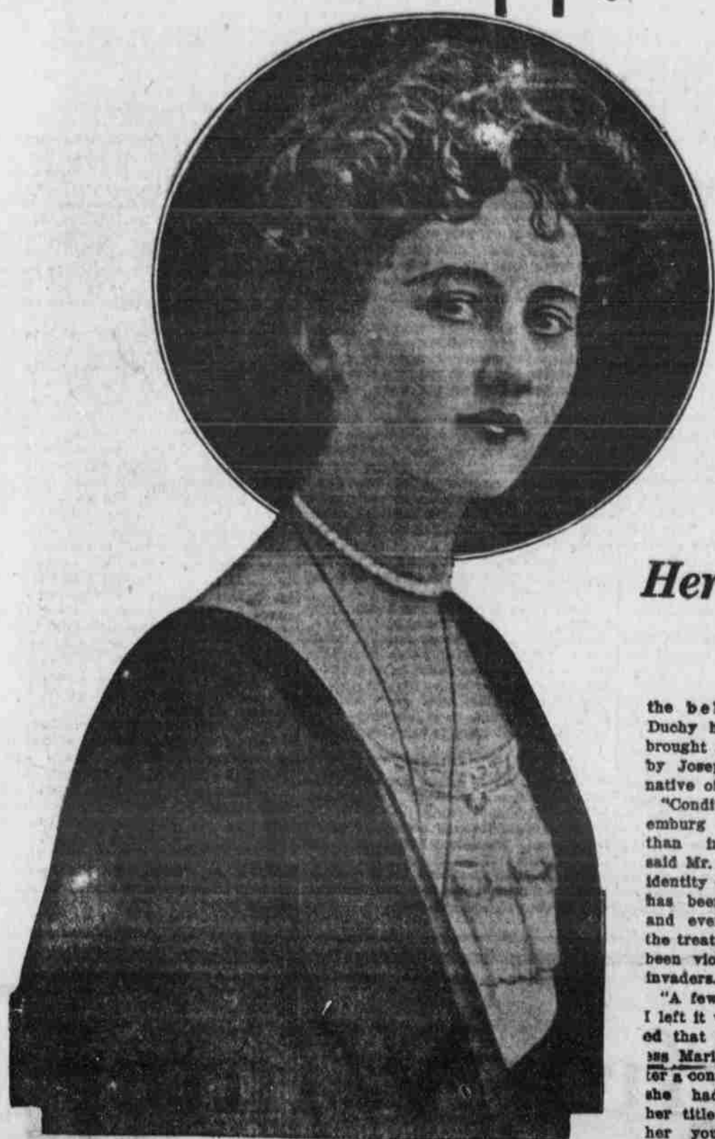
The Grand Duchess Marie as She Appeared at the Time of Her Last Birthday—Her Twenty-first.

THE Grand Duchess Marie Adelaide of Luxemburg is one of the most pathetic figures in the world.