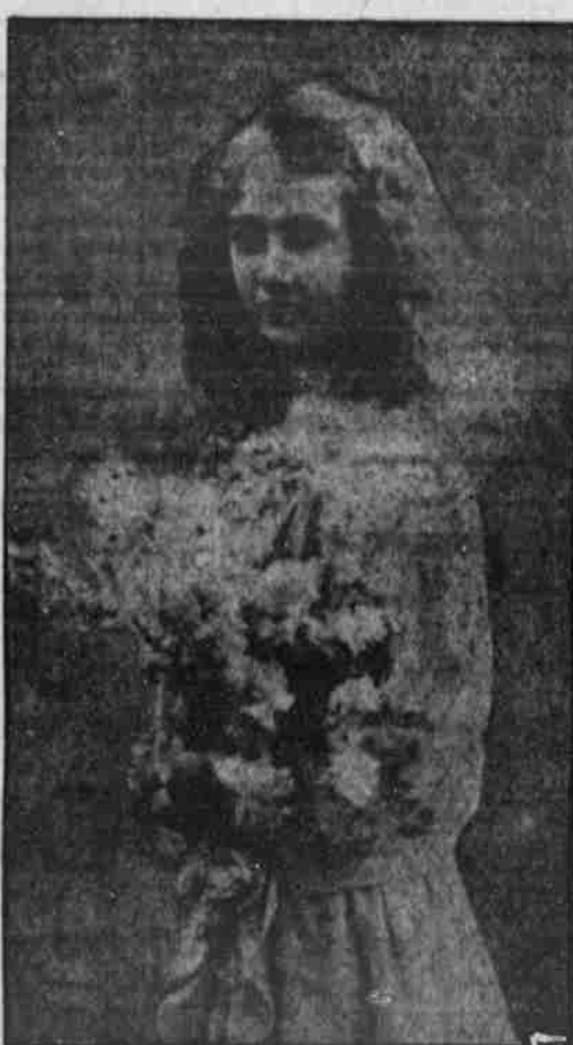
The Little Grand Duchess of Luxemburg at the Time of Her Accession to the Throne

A death-like silence, broken only occasionally, has fallen over Luxemburg. It is rarely that anyone familiar with the place like Mr. Lenoir is allowed to reach the outside world. The inhabitants are not permitted to leave the country except in extraordinary cases. Most of them, moreover, are without means to travel. It is inevitable that there should be many inconsistencies in reports coming from a country in such a position. Many reports reaching neutral countries have represented the Grand Duchess as suffering the extremes of indignity and hardships, while some of the German papers, on the other