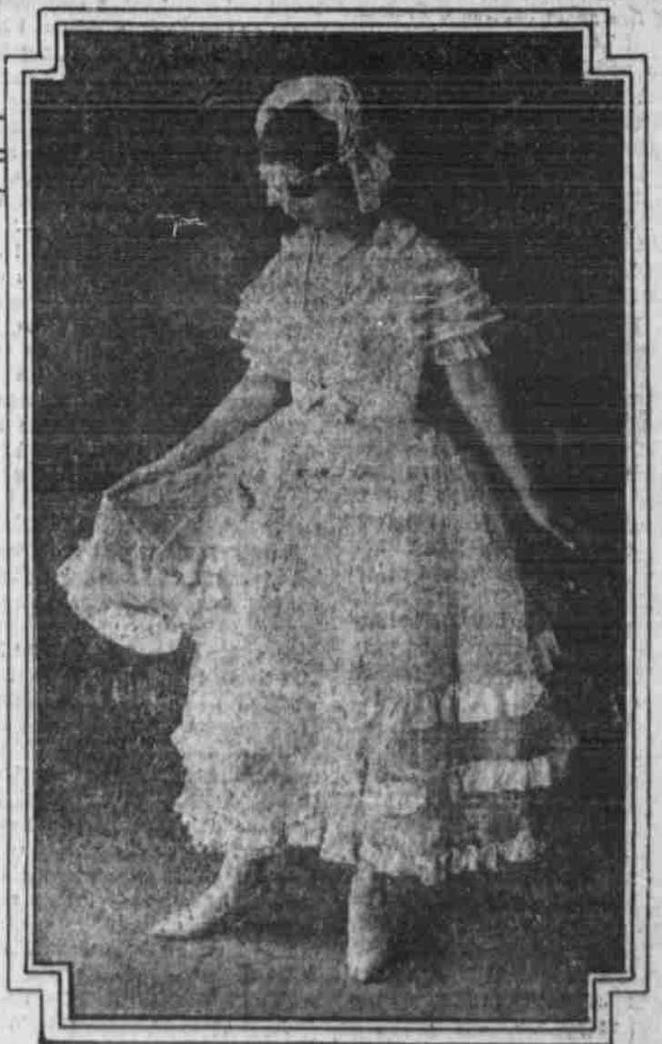
"Three-Decker" Bridesmaid's Dress of Primrose Tulle

a cluster of flowers. The hat is of silver lace and loops of blue ribbon representing the same flowers in the tulle.