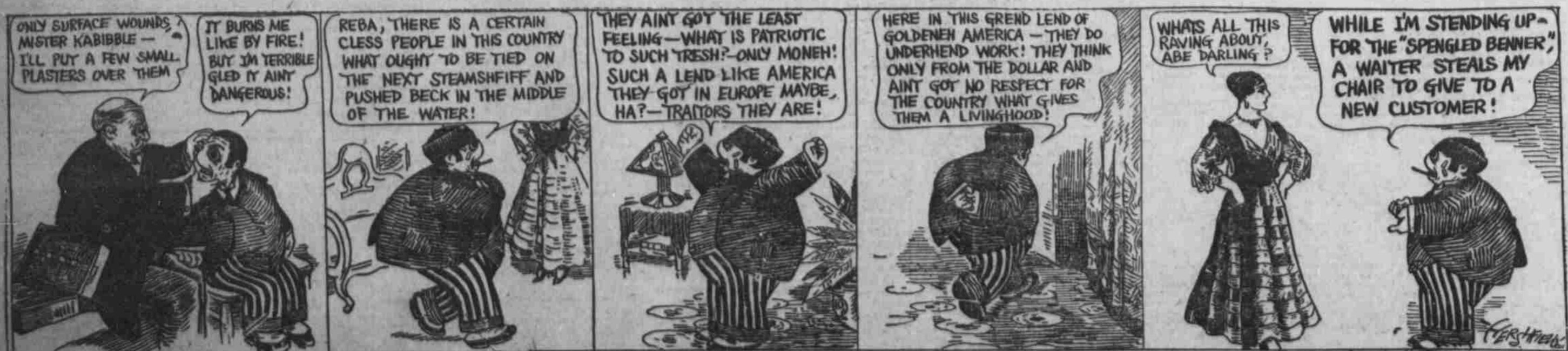
Drawn for The Bee by Herschfield