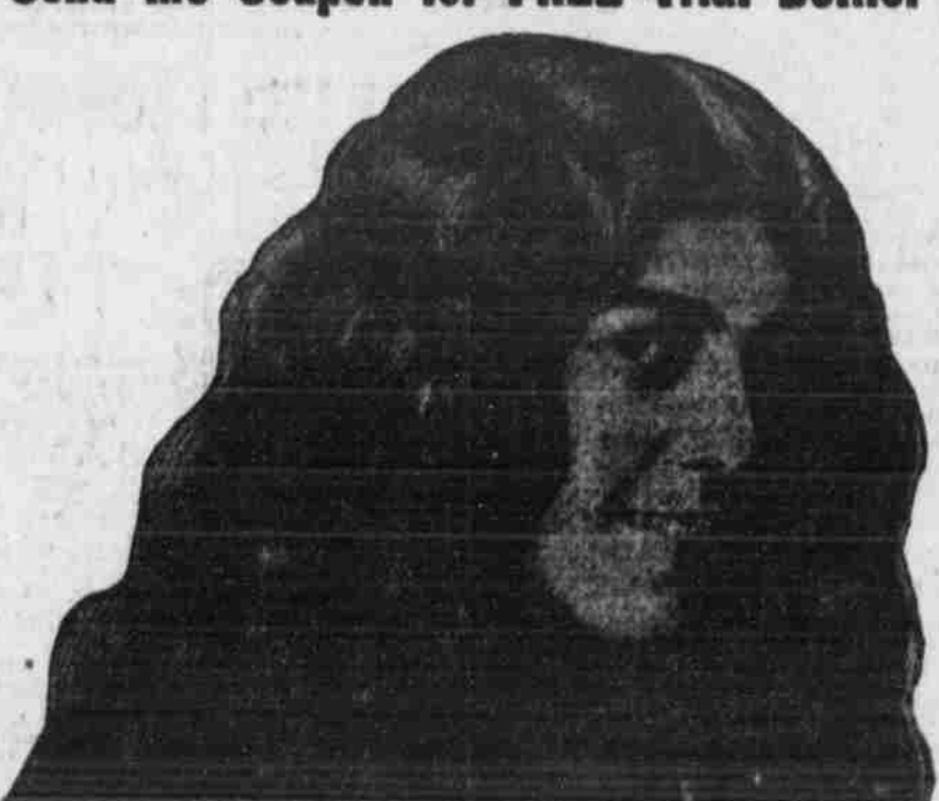
"Brownatone"—the Only Quick, Safe, Satisfactory and Positive Method for Browning and Beautifying the Hair. Most Popular Hair Tinting Instant Hair Stain Better Than Slow