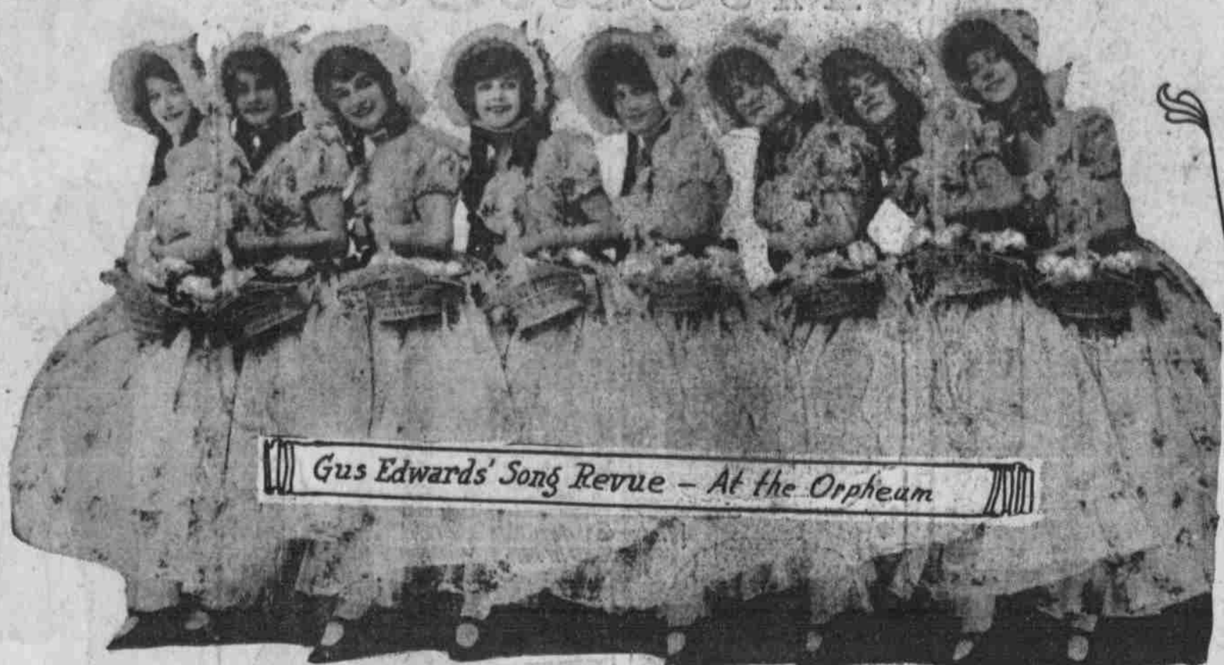
Gus Edwards' Song Revue - At the Orpheum

On Parade Days and Nights the Curtains will not rise until the Pageants have passed the Gayety. The Grand Entrance to the Ak-Sar-Ben Carnival is one block from the Gayety. Effort was made to locate it nearer, but the immensity of our crowds prohibited.