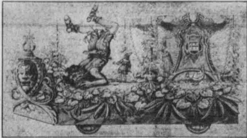
Beauty and the Beast