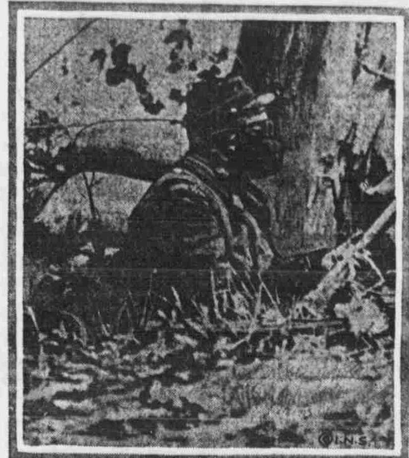
FRENCH SHARPSHOOTER NEAR GERMAN TRENCH.

FRENCH SHARPSHOOTER IN AN ADVANCED TRENCH-Note the goggles and respirator worn as a protection against the frequent use of poisonous gases by the Germans in this district.