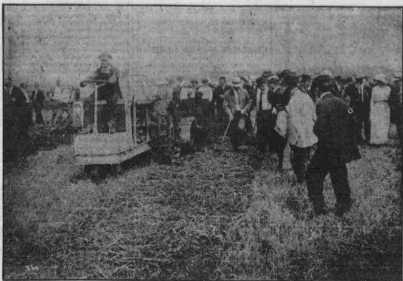
ALLIS-CHALMERS ROTARY TILLER Made by Allis-Chalmers Mfg. Co., Milwaukee, Wis.