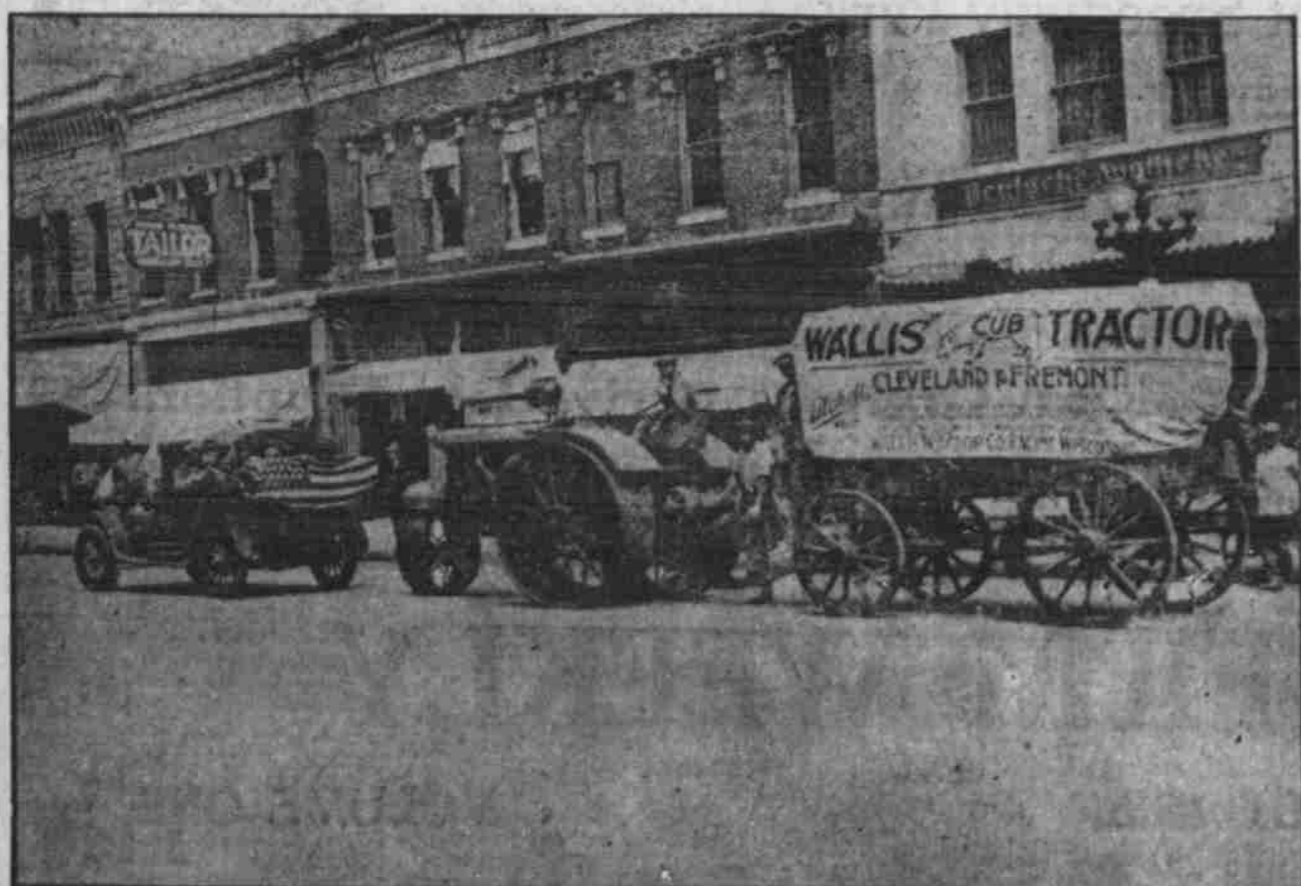
WALLIS "CUB" TRACTOR Made by J. I. Case Plow Works, Racine, Wis.