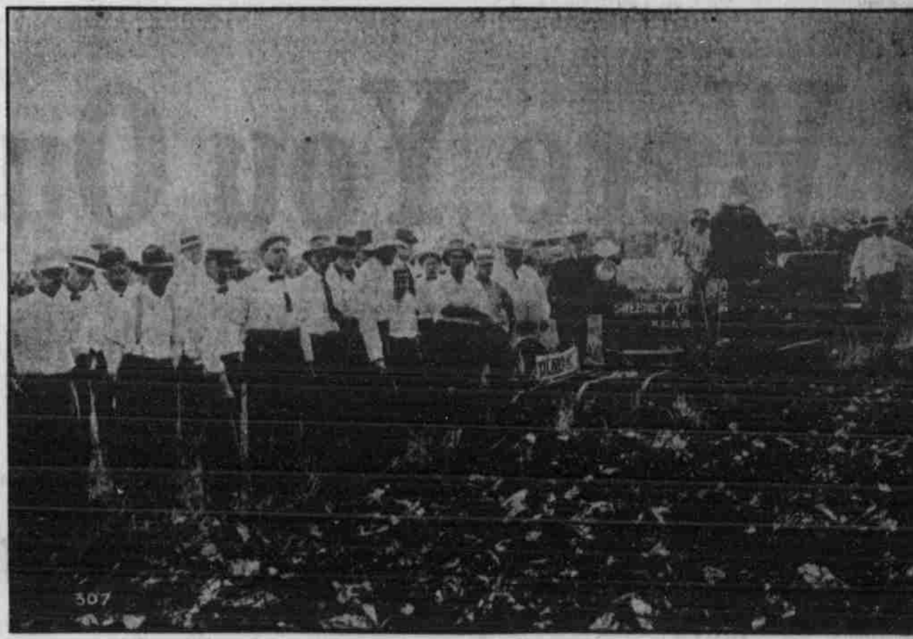
SWEENEY'S IRON HORSE Made by Sweeney Tractor Co., Kansas City, Mo.