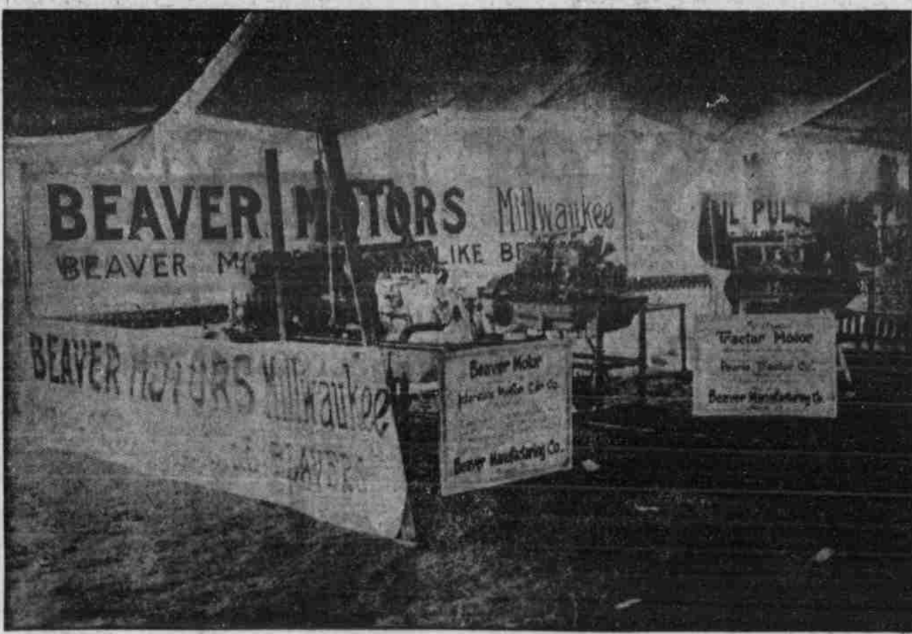
BEAVER MOTORS Made by Beaver Mfg. Co., Milwaukee, Wis.