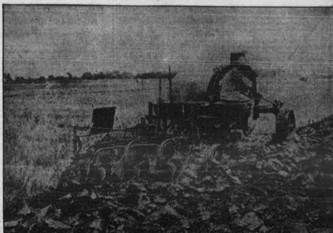
LITTLE DEVIL OIL TRACTOR Made by Hart-Parr Co., Charles City, Iowa.