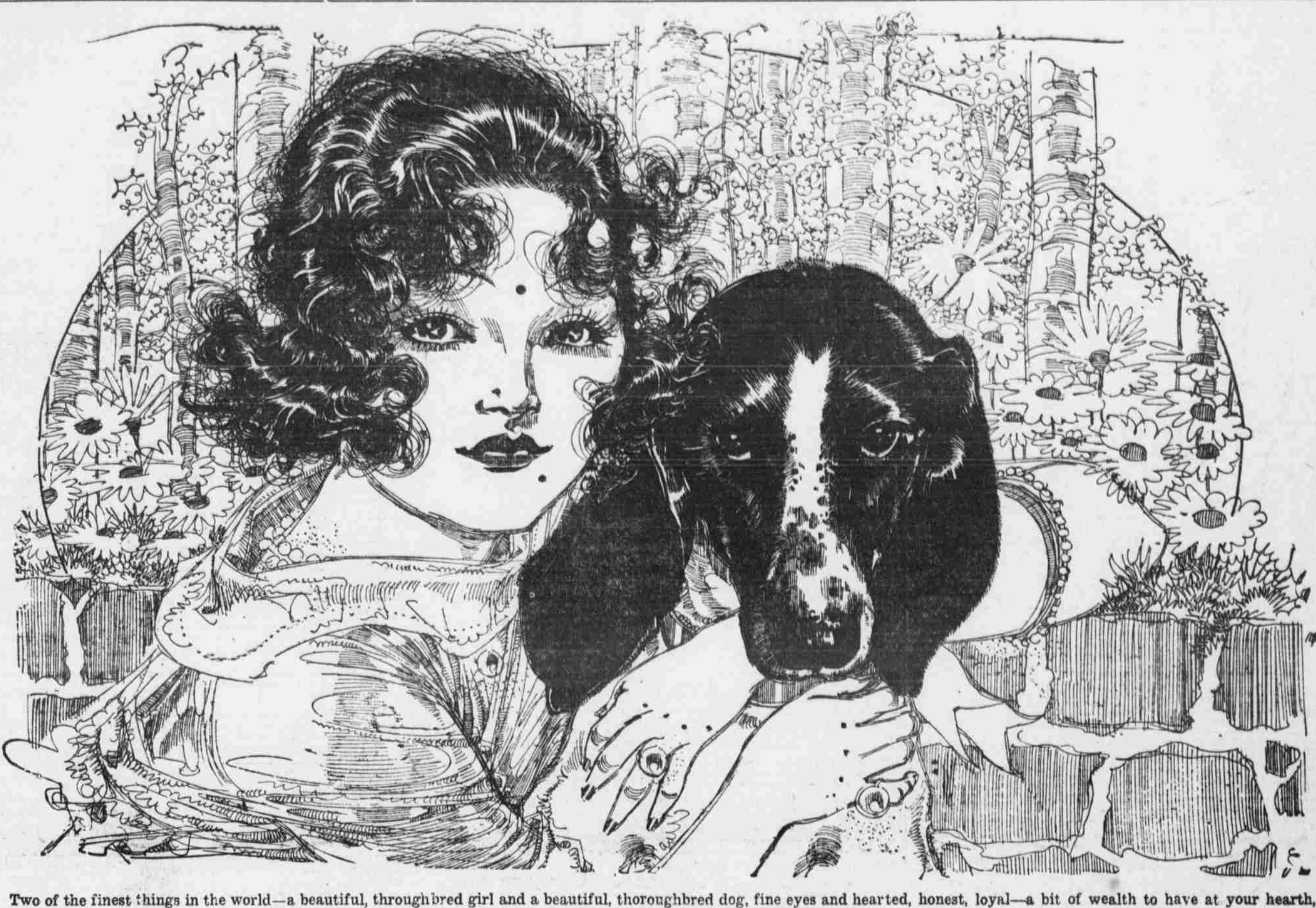
Two of the finest things in the world—a beautiful, through bred girl and a beautiful, thoroughbred dog, fine eyes and hearted, honest, loyal—a bit of wealth to have at your hearth, as real as a gold coin is wealth.-NELL BRINKLEY.