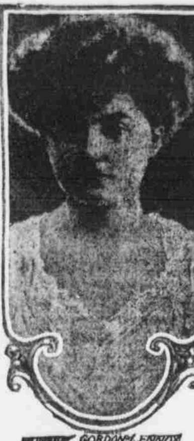
HON. IVY GORDON-LENNOX

HON. IVY GORDON-LENNOX to wed the Marquis of Tichfield, the son of the Duke of Portland, is considered one of the most beautiful women in England.