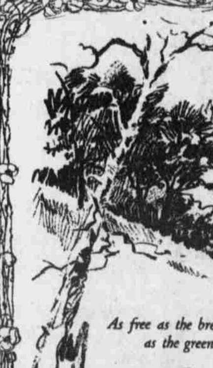
As free as the breeze, as natural as the green grass—The Goddess

The natural breaths of fresh animals, the calls of birds and beasts, the mystic sound of the rain and waterfalls, are truly felt in the beautiful pictures of Vitagraph, and the imaginative writing of Gouverneur Morris, both of which are bathed in the atmosphere of the "country."