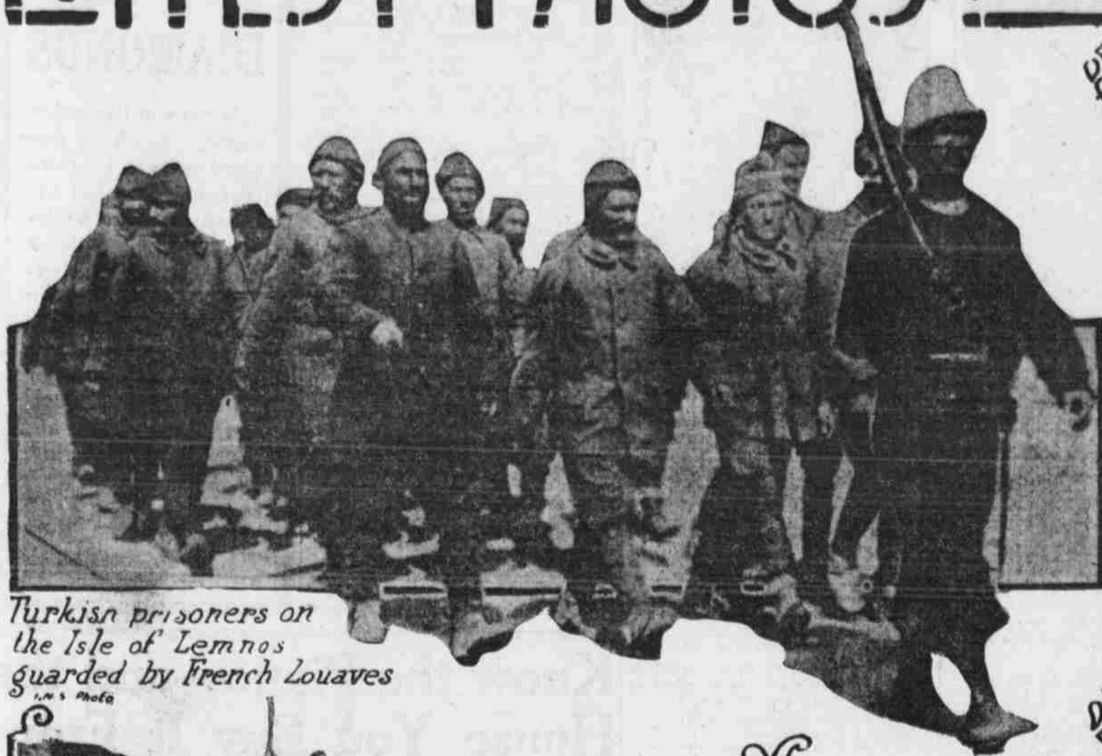
Turkish prisoners on the Isle of Lemnos guarded by French Louaves