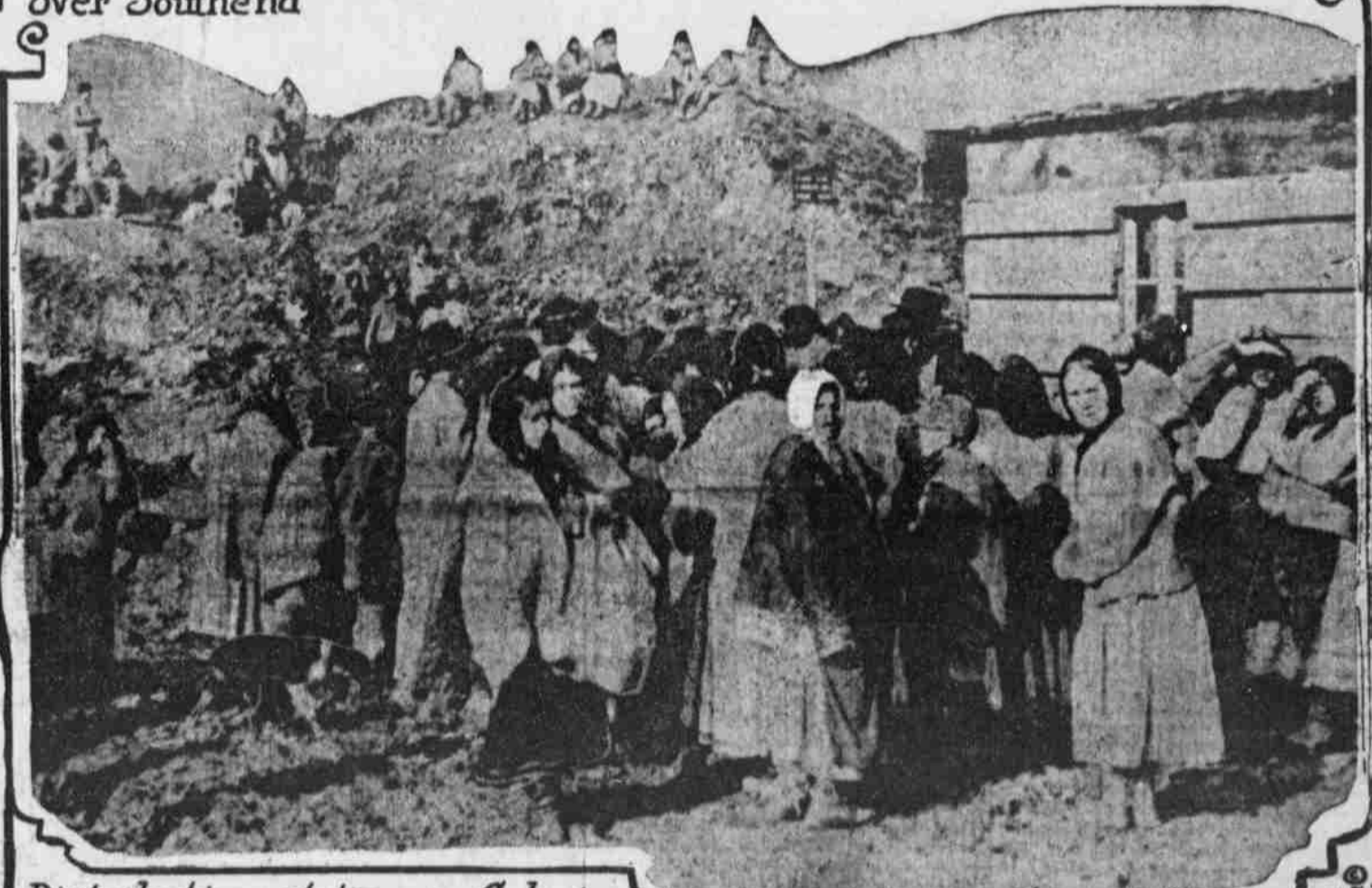
Distribution station in Galicia for furnishing salt and bread to the peasantry during the campaign