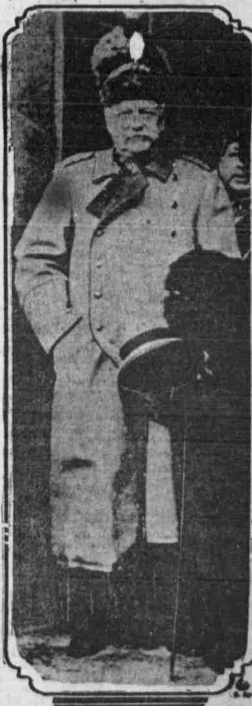
Prince Von Bulow, Germany's special envoy to Italy, ready to take his leave from Rome