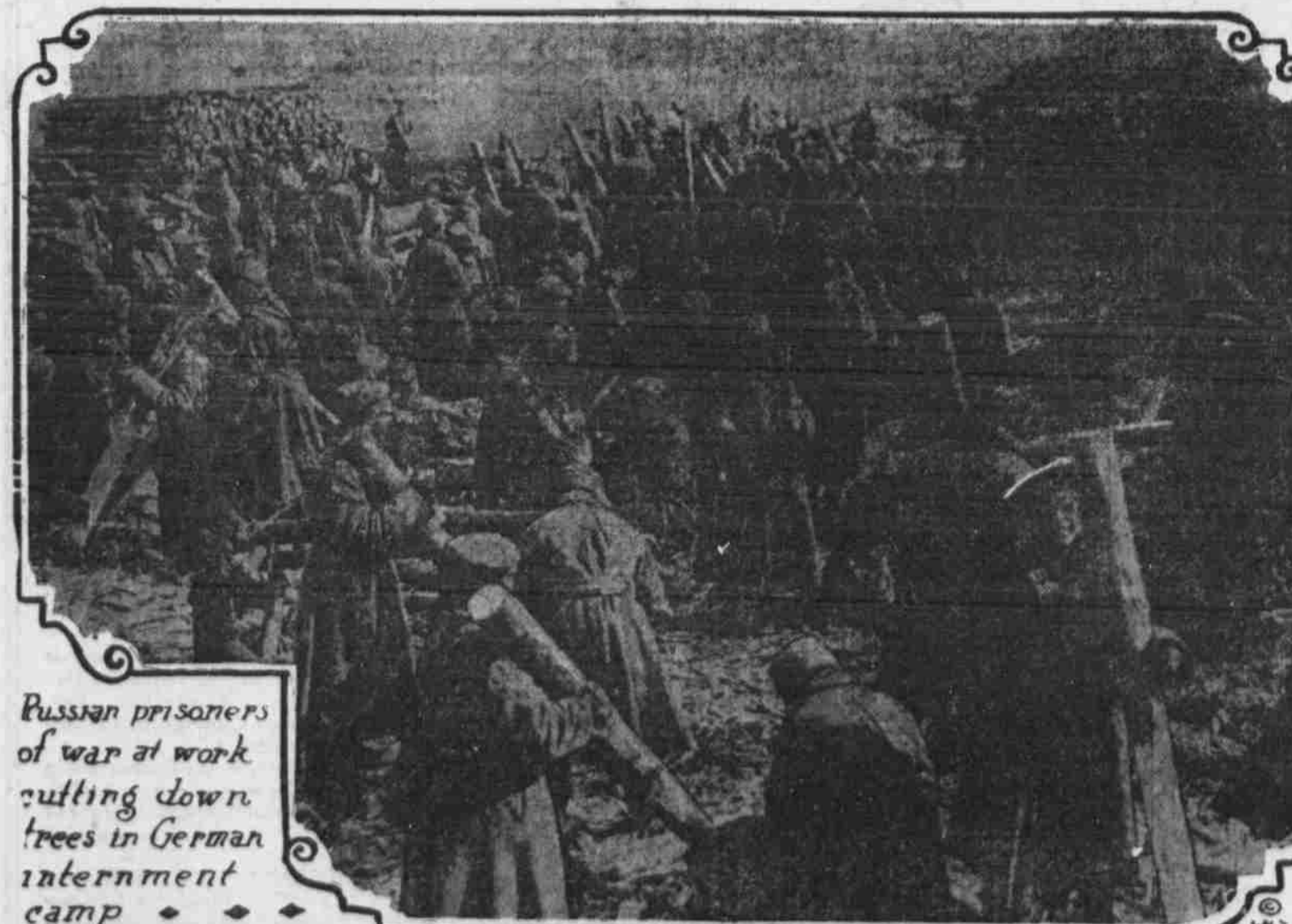
Russian prisoners of war at work cutting down trees in German internment camp