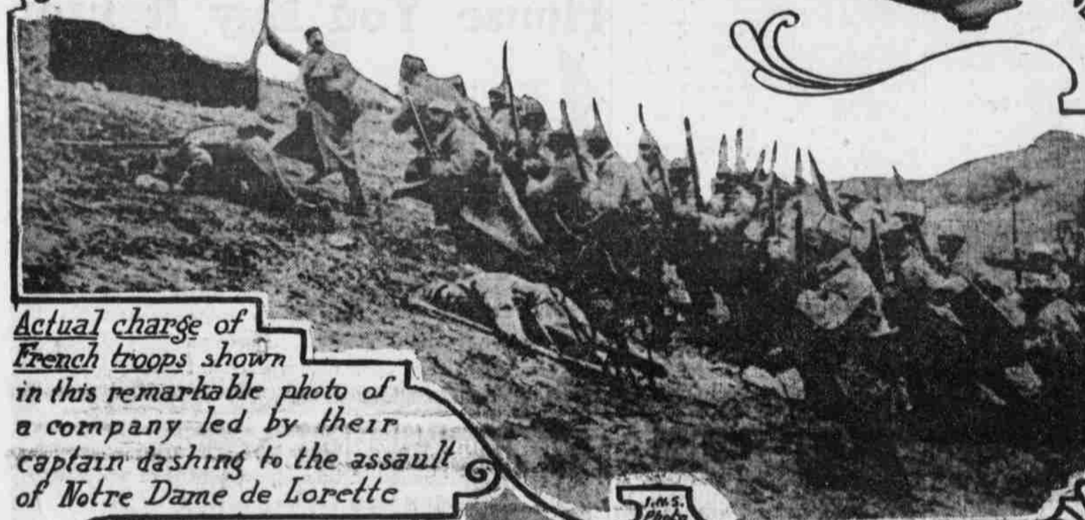
Actual charge of French troops shown in this remarkable photo of a company led by their captain dashing to the assault of Notre Dame de Lorette