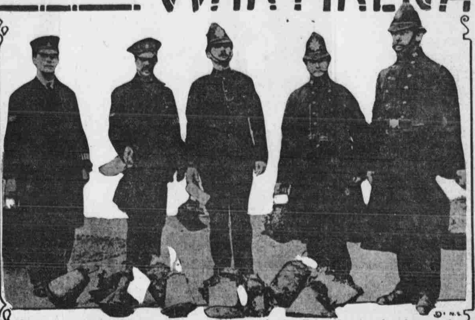
British police holding some of the incendiary Zeppelin bombs dropped over Southend