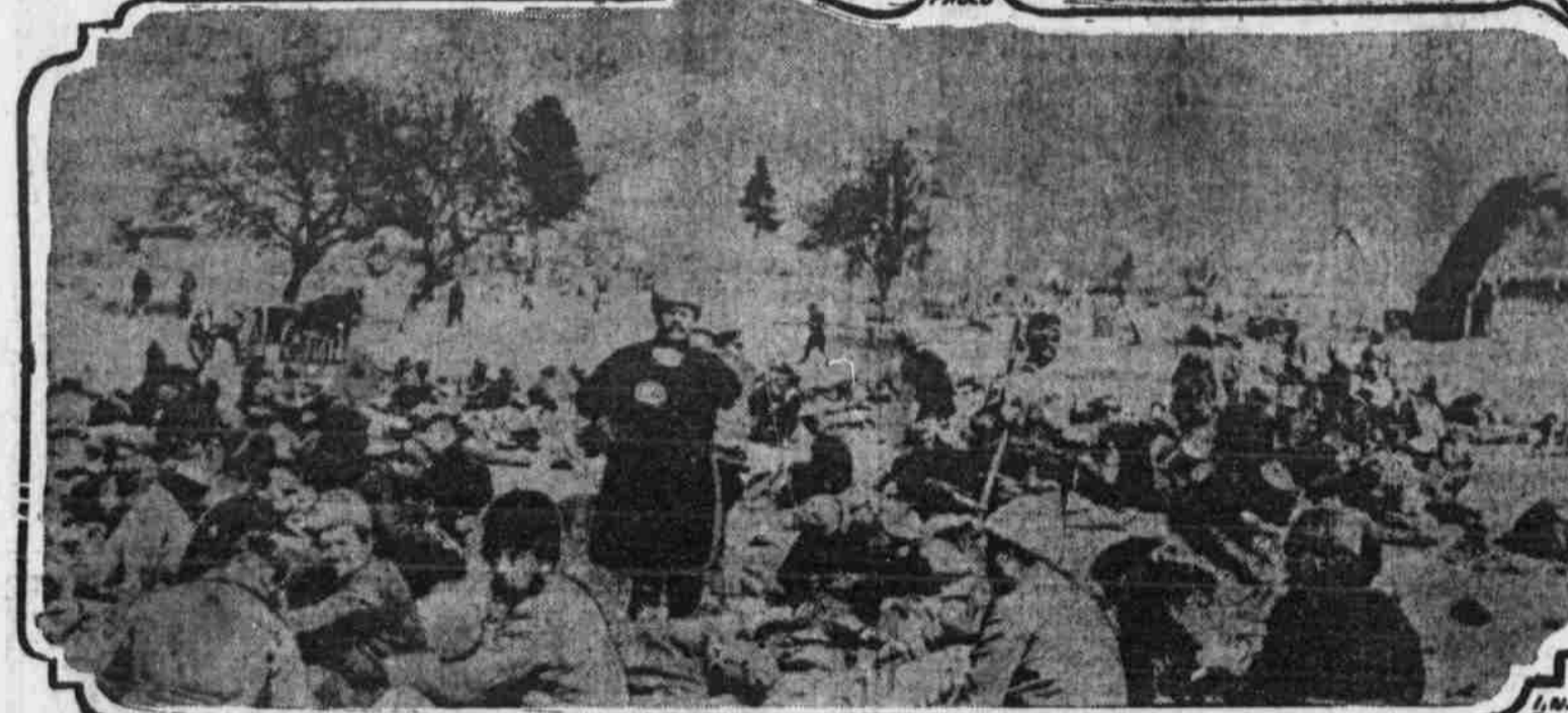
Russian prisoners taken during the great drive that recaptured Przemyśl for Austria