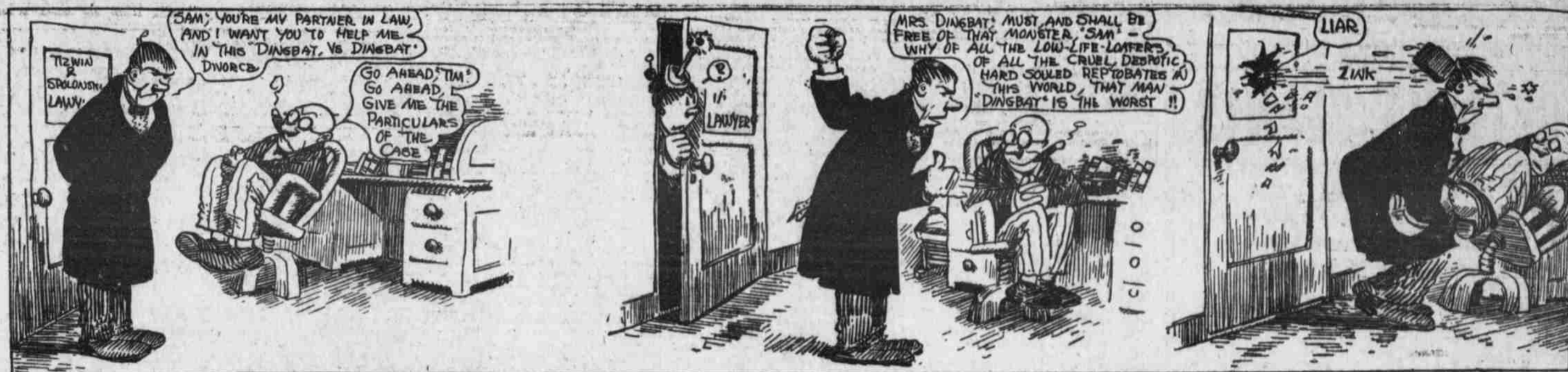
ABIE THE AGENT--And His Explanation Has Official Approval