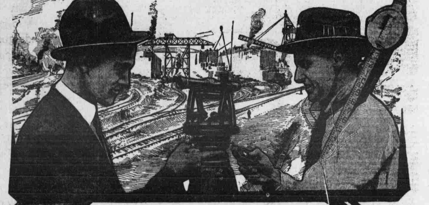
"It's Always STAR When Good Fellows Get Together"