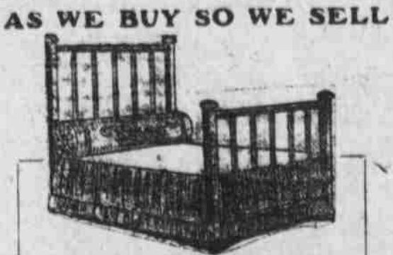
HERE IS ANOTHER BIG BARGAIN BRASS BED

Satin finish, the highest grade con-struction and finish, guaranteed by us, which is an absolutely safe guarantee. Posts are 2-in. in diameter. Again you a half at our price $26.00