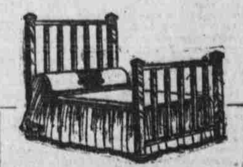
THIS IS A BED OF UNUSUAL MERIT

Satin finish, the highest grade con-struction and finish, guaranteed by us, which is an absolutely safe guarantee. Posts are 2-in. in diameter. Again you a half at our price $26.00