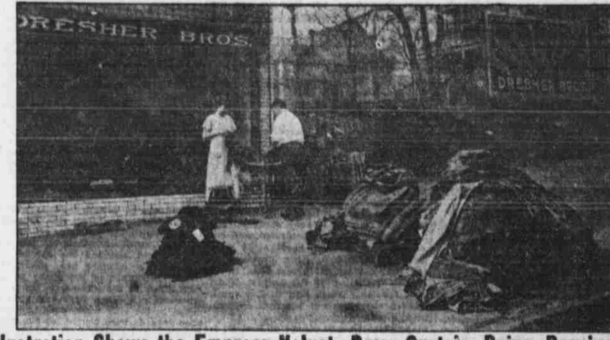
Illustration Shows the Empress Velvet Drop Curtain Being Received at Dresher Brothers Cleaning and Dyeing Plant

have a piece of ROYAL PURPLE VEL-VET DYED TO A RICH GOLDEN YELLOW, the chances are the cleaner would throw up his hands and say; 'Impossible.'