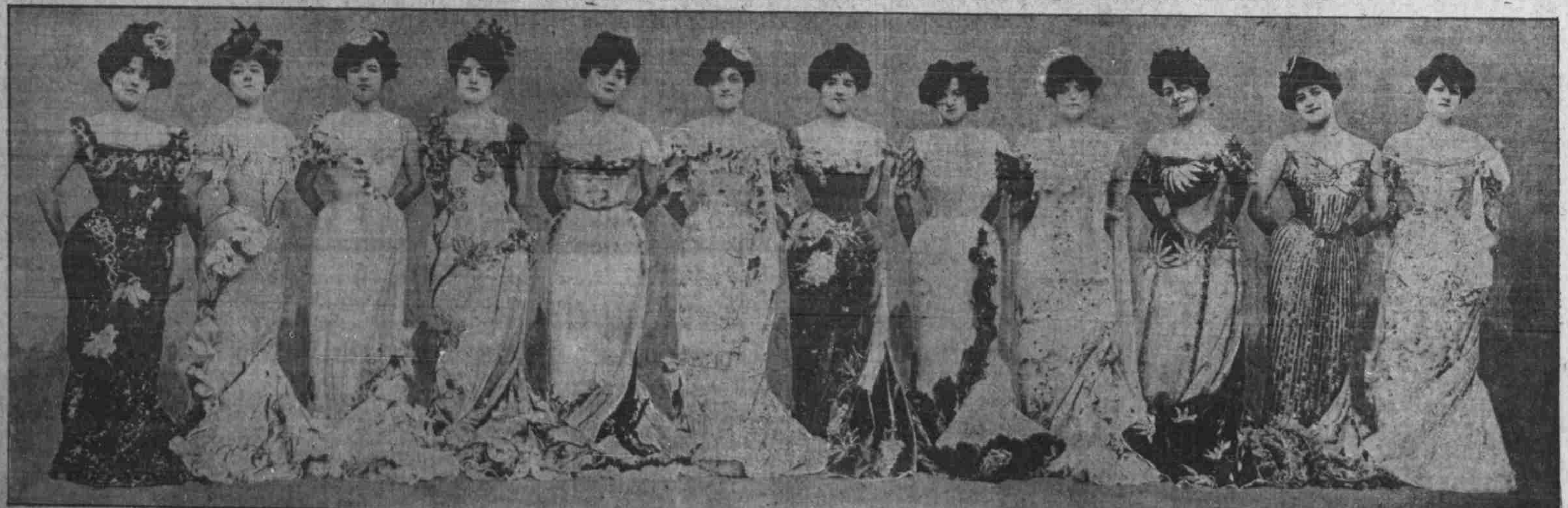
The Original Show Girls as Invented and Patented by Mr. Ziegfeld-These, He Confesses. Were Dummies, Copyright, 1915, by the Star Company. Great Britain Hights Reserved.

The result was satisfying. The critics halled a novelty. The public welcomed the big, near-gawky girls, that somehow had had some stateliness drummed into them, though it had cost months and tears and