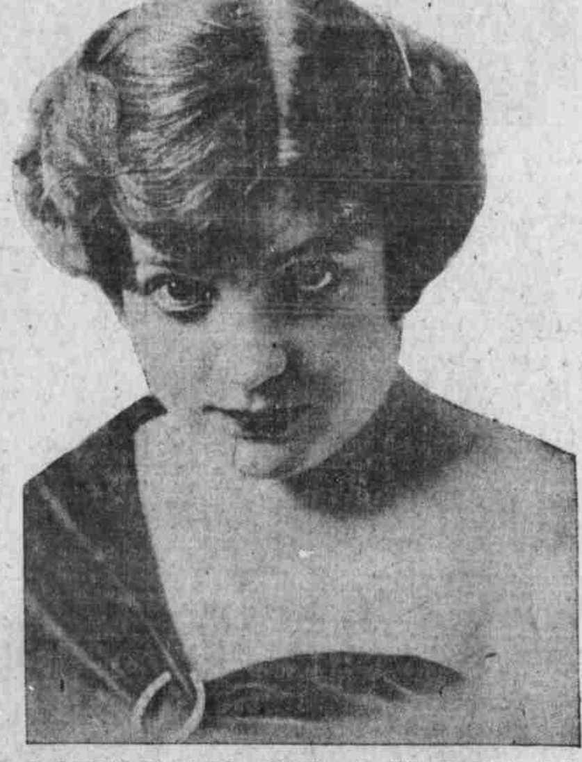
Head of 1915—Model Show Girl Showing What Is Claimed to Hold Some Brains and Mouth that Is Designed to Speak a Few Words Coherently and Even Sing a Little.

The Real Truth Revealed by the Inventor of Show Girls