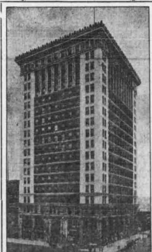
W. O. W. Building, Omaha