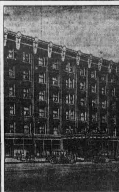
Castle Hotel, Omaha