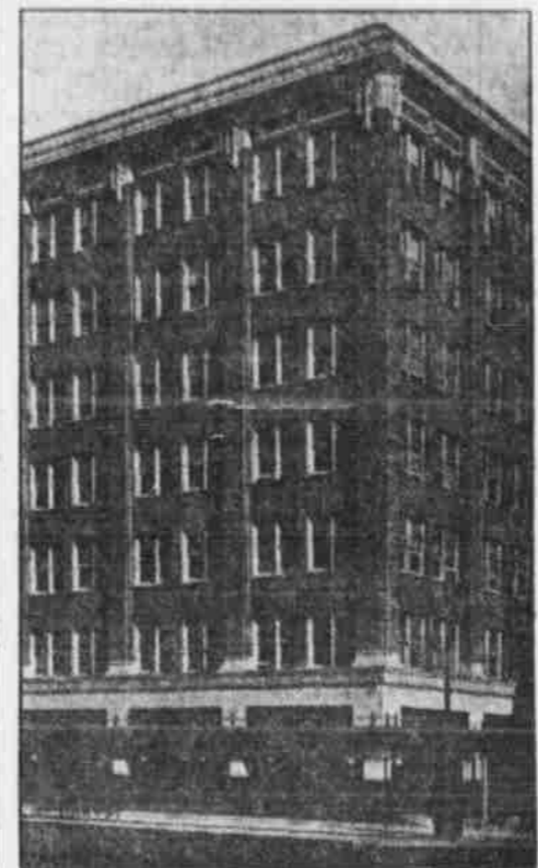
Oscar Keeline Building