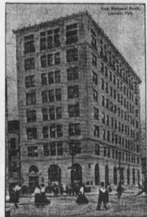
First National Bank, Lincoln, Neb.