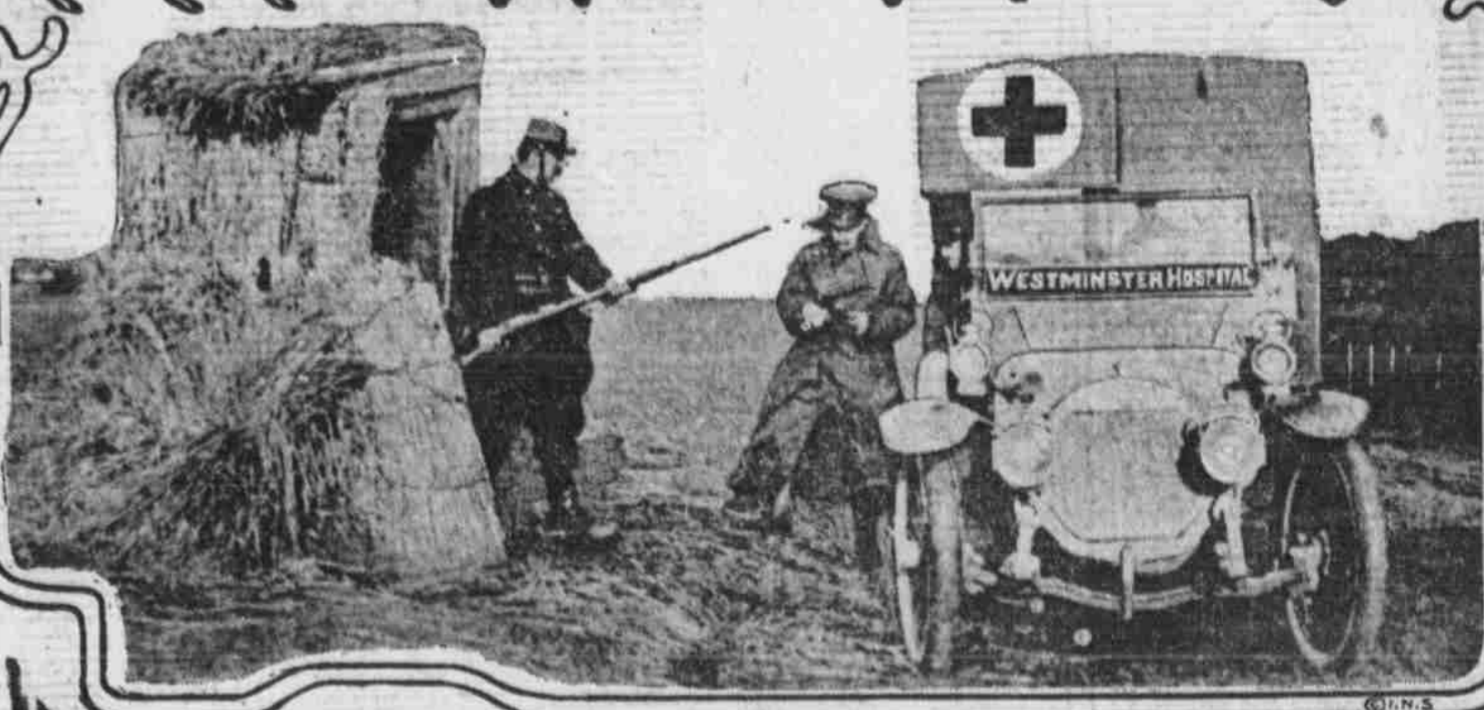
French sentry shows extreme care in requiring identification of Red Cross