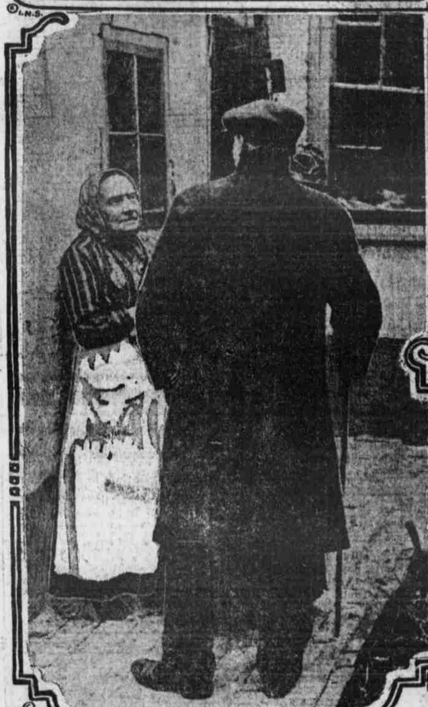
Old lady in picture had just closed door of her house at King's Lynn when aerial bomb tore it off its hinges