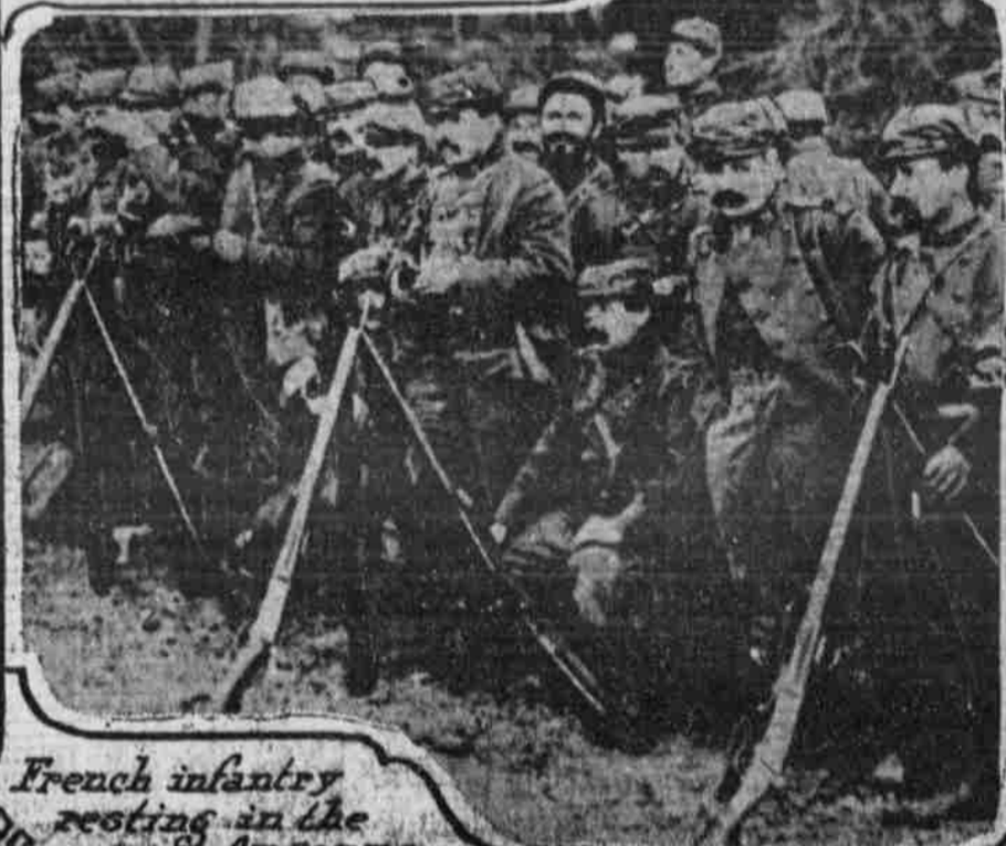
French infantry resting in the Argonne