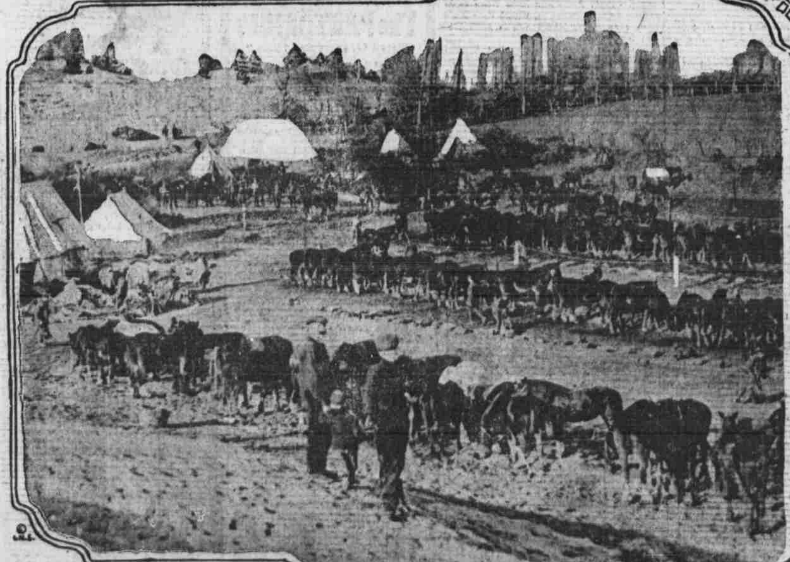
Horse camp maintained at Le Torquet for sick and wounded animals by French Blue Cross Society