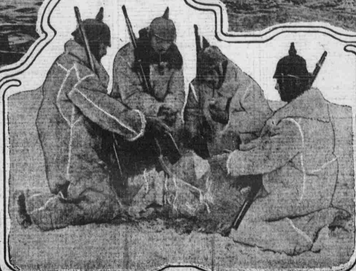
German infantry men in Poland trying to warm themselves over a fire