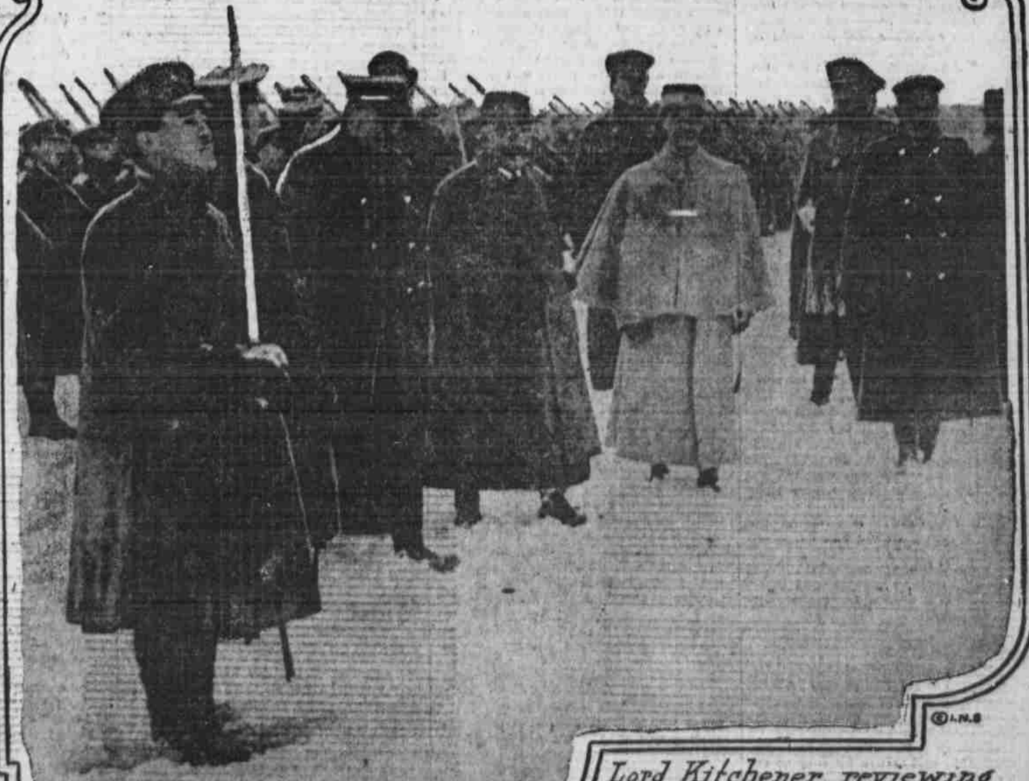
Lord Kitchener reviewing troops in the snow