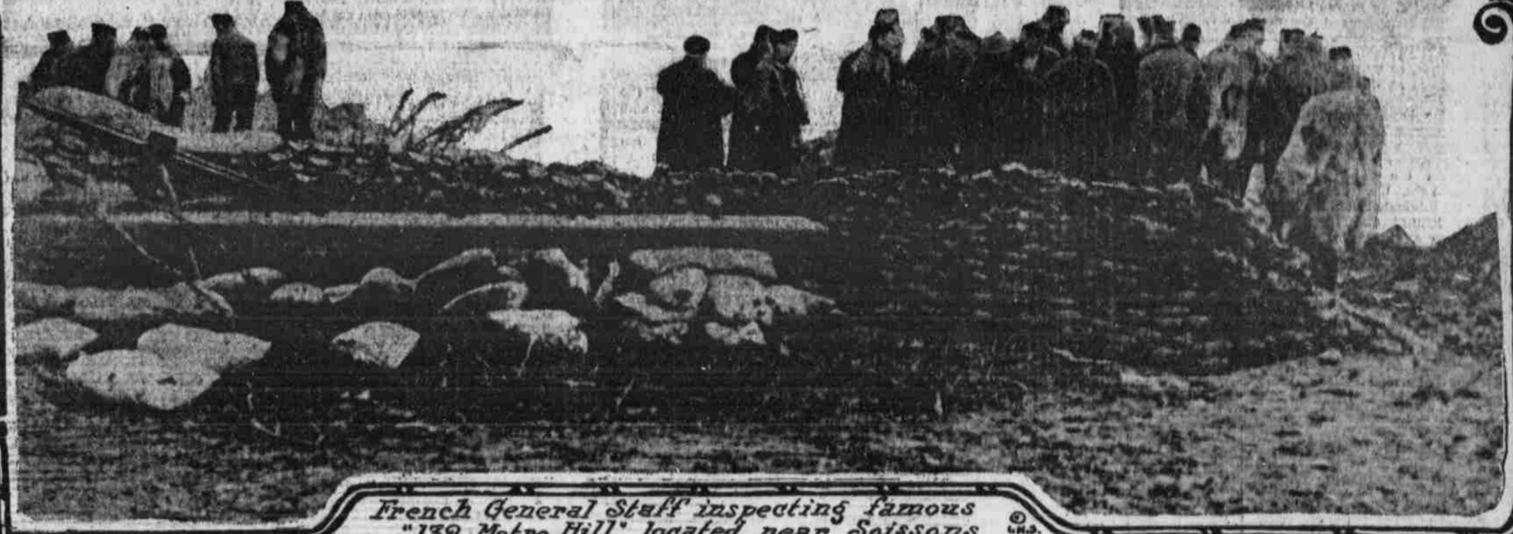
French General Staff inspecting famous "132 Metre Hill" located near Soissons