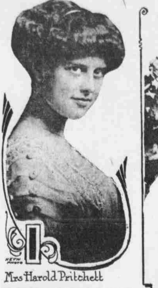
WILL ATTEND MEETING OF THE NATIONAL D. A. R.

Patronesses of Creighton Glee Club Concert