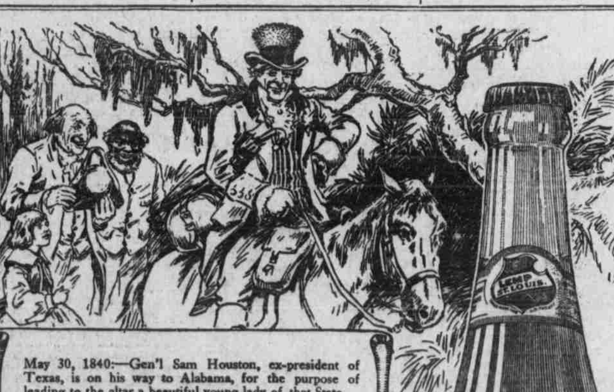
May 30, 1840—Gen'l Sam Houston, ex-president of Texas, is on his way to Alabama, for the purpose of leading to the altar a beautiful young lady of that State.