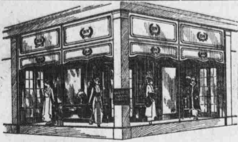
PEN AND INK SKETCH OF OUR NEW DISPLAY WINDOW AT THE CORNER OF SIXTEENTH AND HARNEY—OPENED TO VIEW FOR THE FIRST TIME—SATURDAY

cruted to care for the Holiday throng, assures intelligent and prompt service. Start early in the morning to complete your shopping list—but 10 SHOPPING DAYS BEFORE CHRISTMAS.