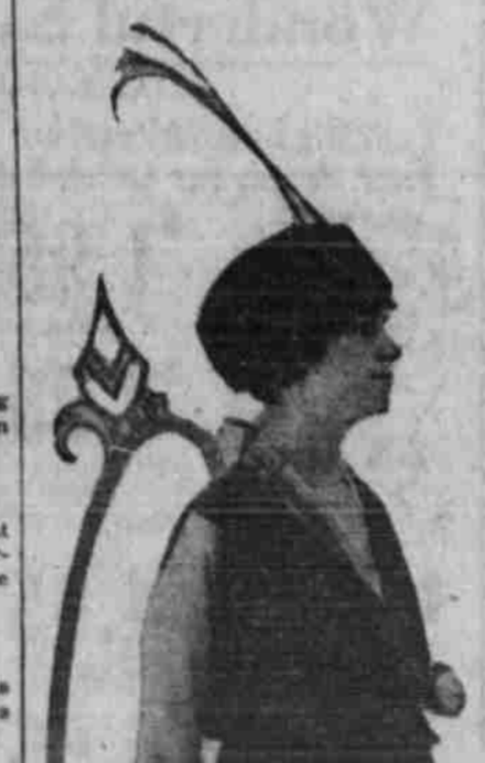
Gown of black satin, overcast of black net, banded with wide black velvet ribbon. A bodice of brocade, set trimmed with sleeves and collar of net. A single red rose is caught at the left side.