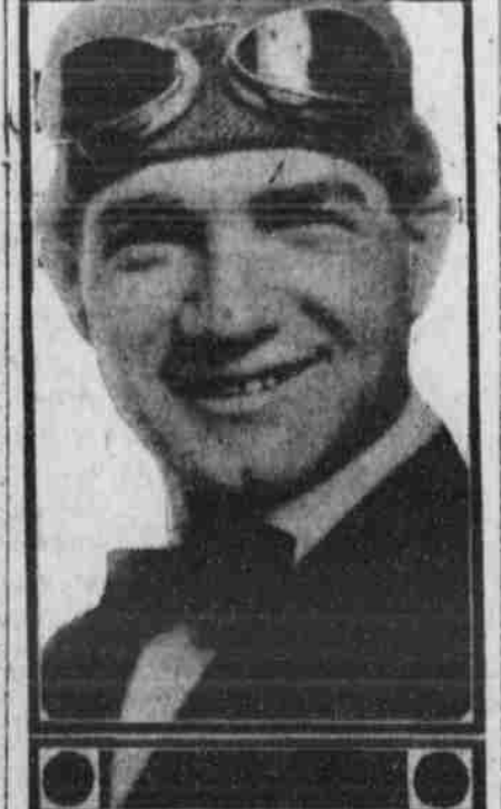
RALPH DE PALMA.