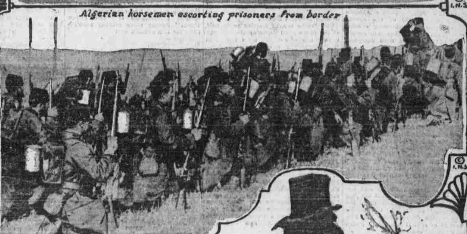
French infantry on the sand dunes near Diamude awaiting orders to advance