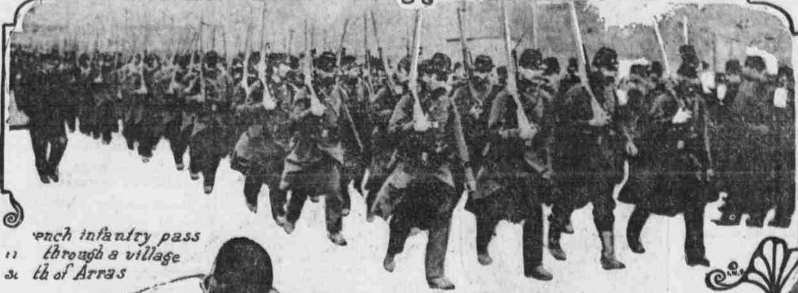
French infantry pass through a village south of Arras