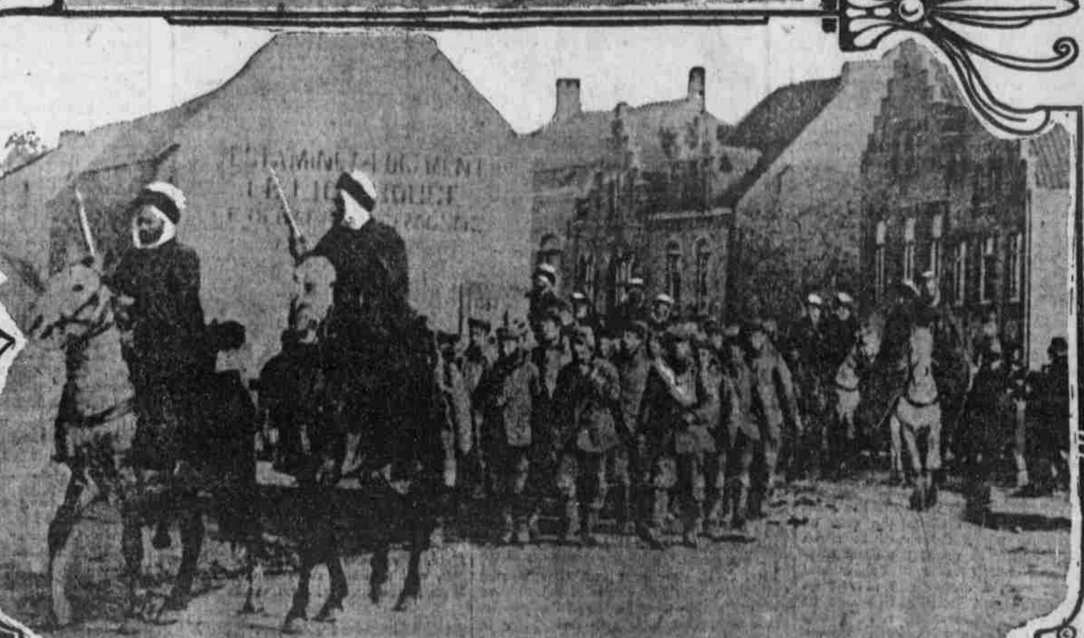
Algerian horsemen escorting prisoners from border