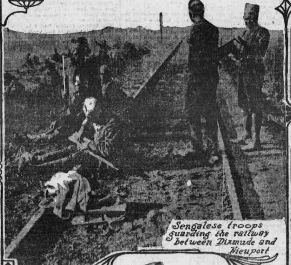
Sengalese troops guarding the railway between Diamude and Nieuport