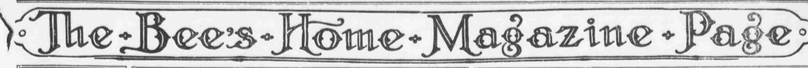
THE BEE: OMAHA, TUESDAY, NOVEMBER 17, 1914.