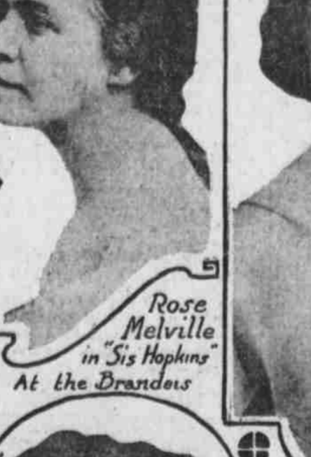
Rose Melville in "Sis Hopkins" At the Brandeis