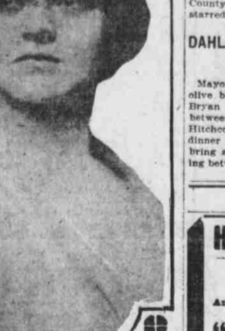
Aileen Stanley At the Orpheum