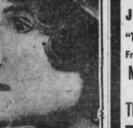
Elissa in "Cabiria"