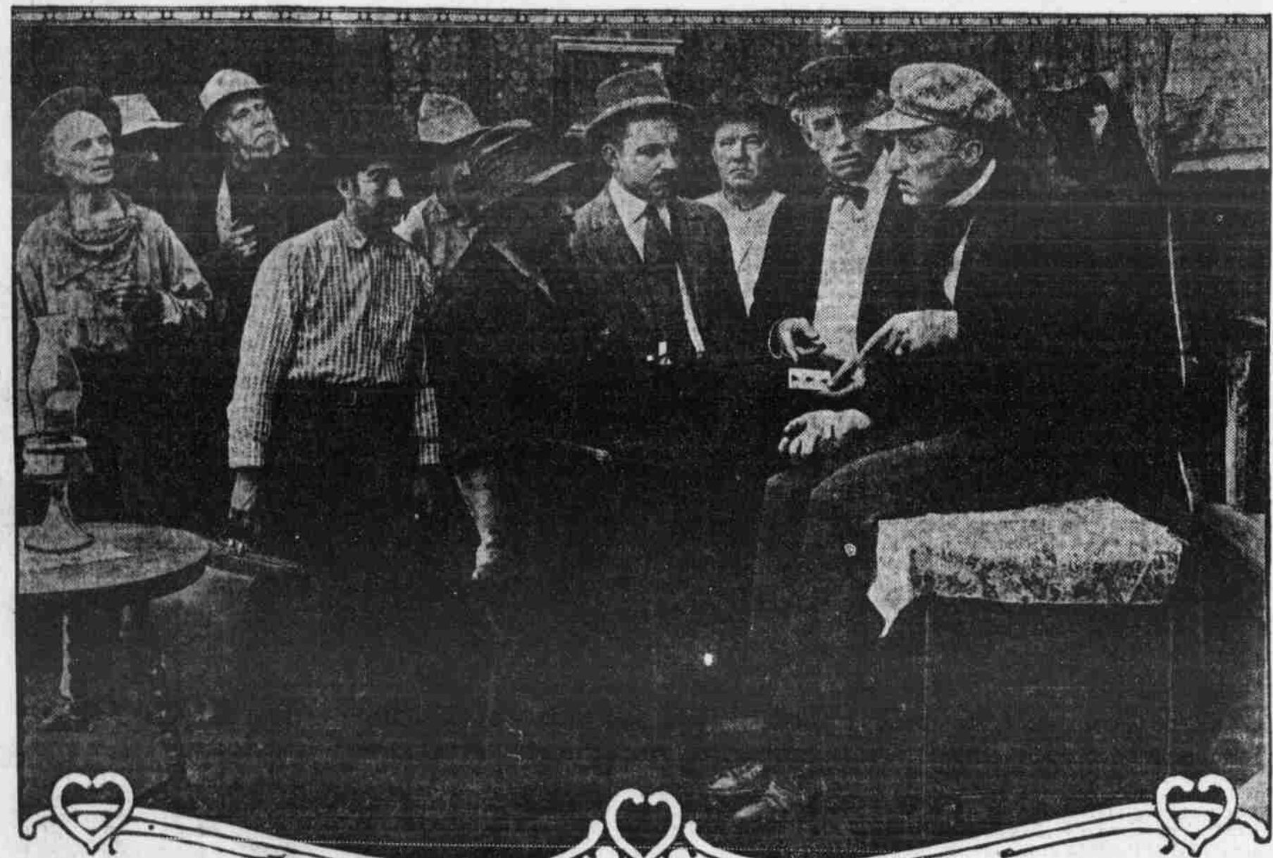
Furnished in His Coat Pocket and Brought Forth a Playing Card.

ber of Seneca Trine, where the cripple lay possessed by seven devils of insensate rage.