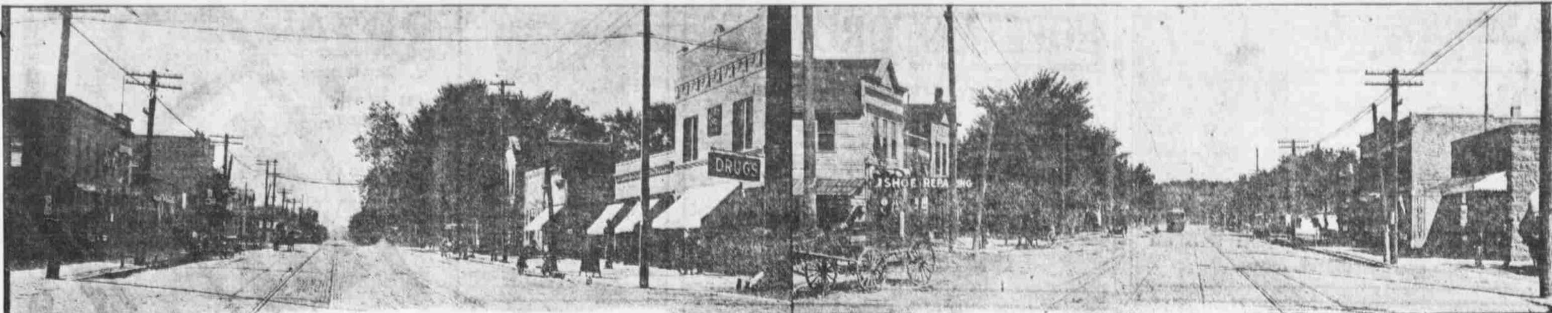
MAIN STREET, FLORENCE, NEB., LOOKING NORTH FROM JEFFERSON STREET.