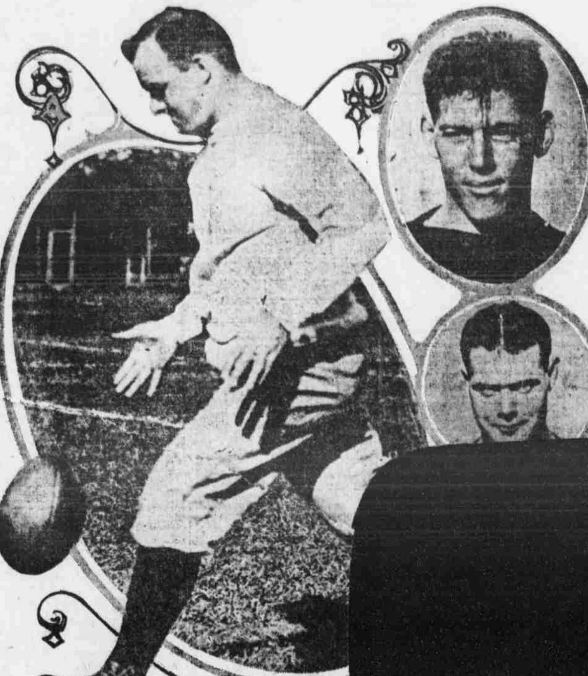
Harvard's Great Veteran Backfield

OMAHA, SUNDAY MORNING, SEPTEMBER 27, 1914.