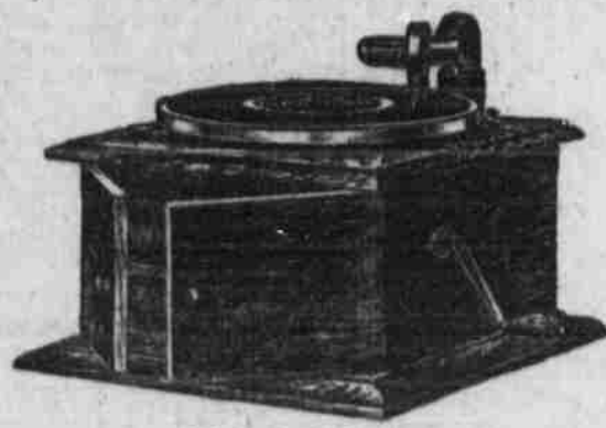
Victrola IV, $15 Oak

No home need be without a Victrola—$15 to $200.