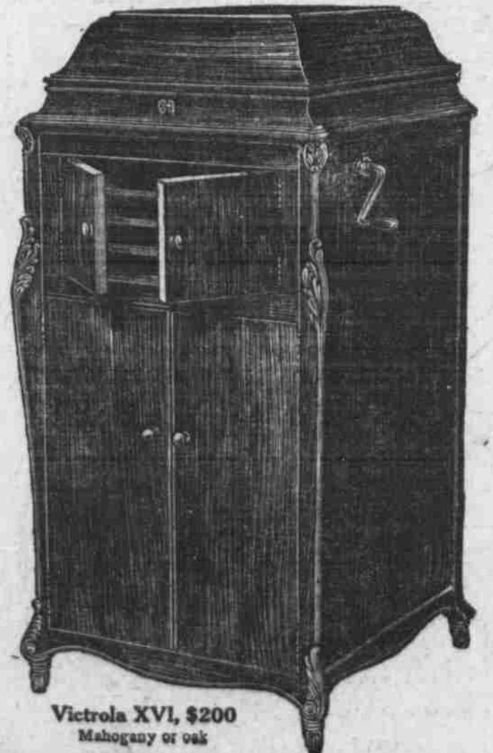
Victrola XVI, $200 Mahogany or oak

Victor Talking Machine Co. Camden, N. J.