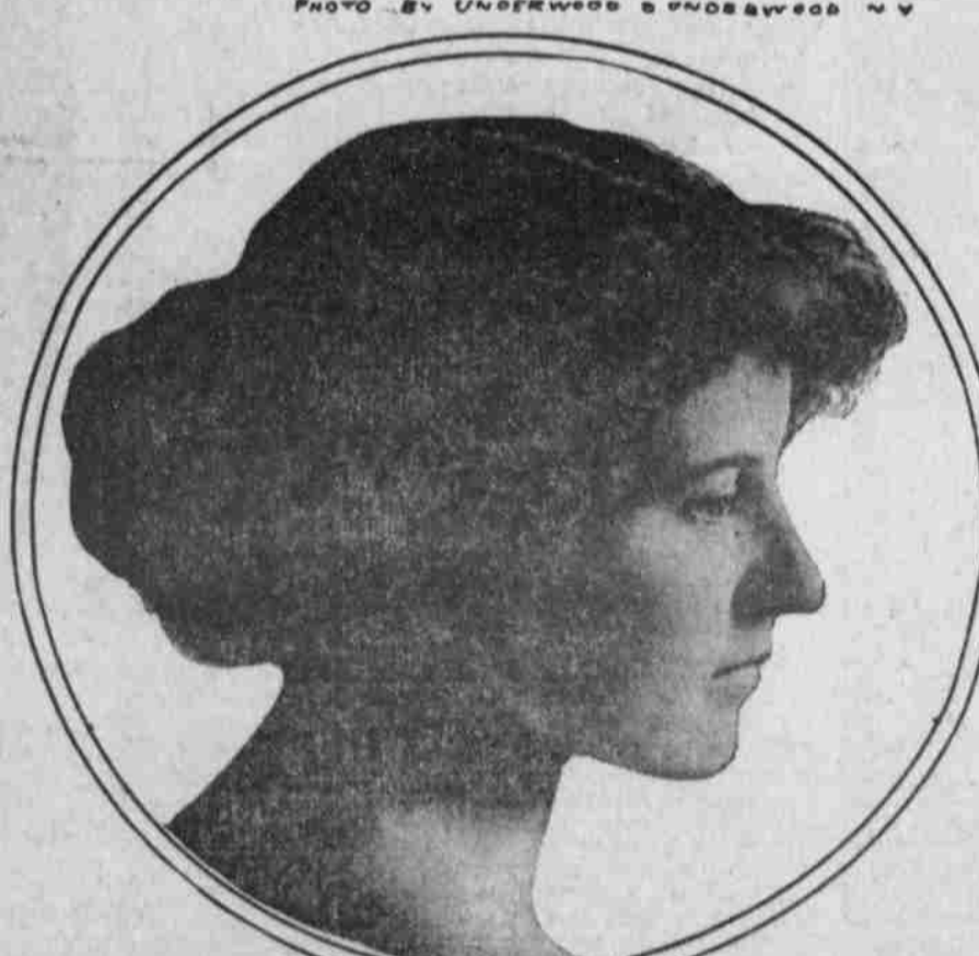
Mrs. Inez Millholland Boissevain, the Beautiful American Militant Suffragist. On the Right—Mrs. Pankhurst, Arrested in a Raid on Buckingham Palace. Mrs. Pankhurst and Her Militants Are the Only English People of Heroic Stuff Left There, Thinks Mrs. Boissevain.