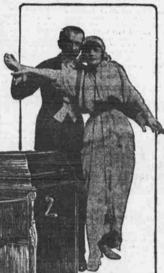
Mr. and Mrs. Vernon Castle dancing the Half and Half

Victor Talking Machine Co. Camden, N. J.