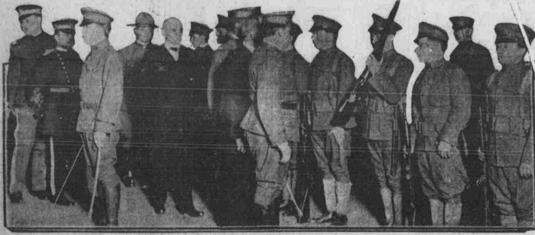
GOVERNOR MOREHEAD PERSONALLY INSPECTS THE GUARD.