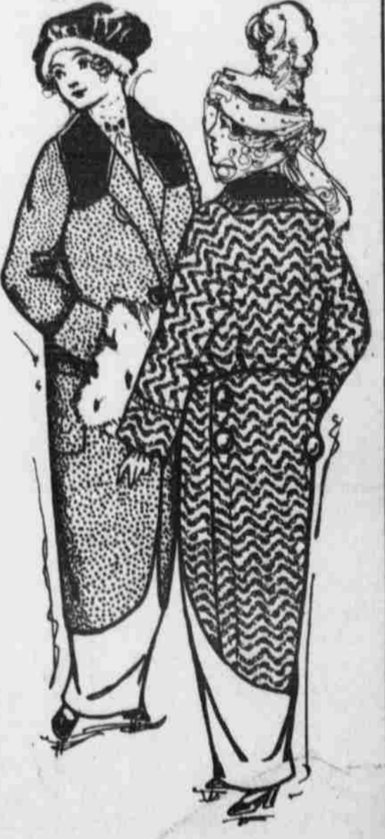
Remember, our entire stock of ready-to-wear is included at exactly 1/2 PRICE.